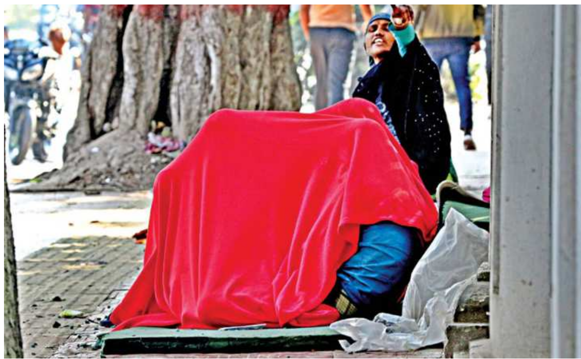
About three-four people taking drugs under the red blanket on a footpath near the High Court premises in the evening yesterday. Mostly homeless people are often seen taking drugs on relatively quiet streets in the capital.

Wildfires across Siberia lasting well into the autumn released a record quarter-billion tonnes of carbon dioxide into the atmosphere, equivalent to the annual emissions of Spain, Egypt or Vietnam, and a third more than in 2019, the previous record year.