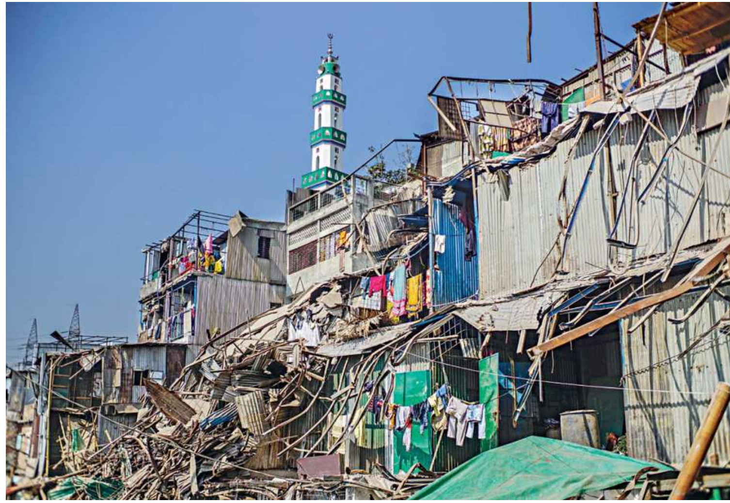
The laundry put out to dry is the telltale sign that people are still living in the almost destroyed shanties in Old Dhaka's Islambagh. The Bangladesh Inland Water Transport Authority knocked down several shanties in the slum on Tuesday. The photo was taken yesterday.