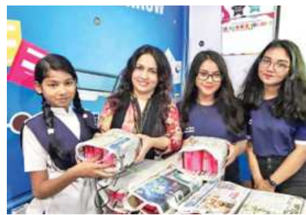
Team members of Solace distributing reusable sanitary napkins in Sylhet

Solace also organised a virtual bake sale in August and all the proceedings of the event were used to purchase reusable sanitary napkins for the flood victims in Sylhet. As far as their annual events are concerned,