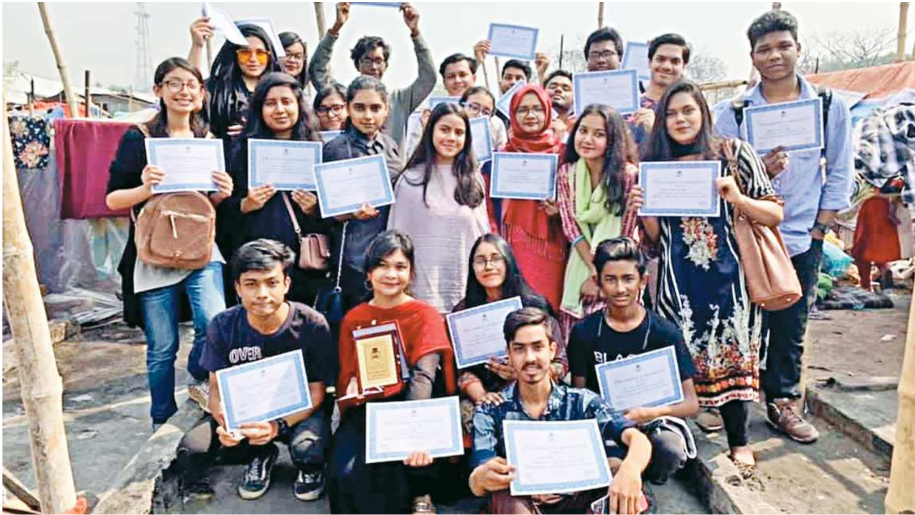
Team members and volunteers of Solace with their certificates, after the distribution drive in Banani.