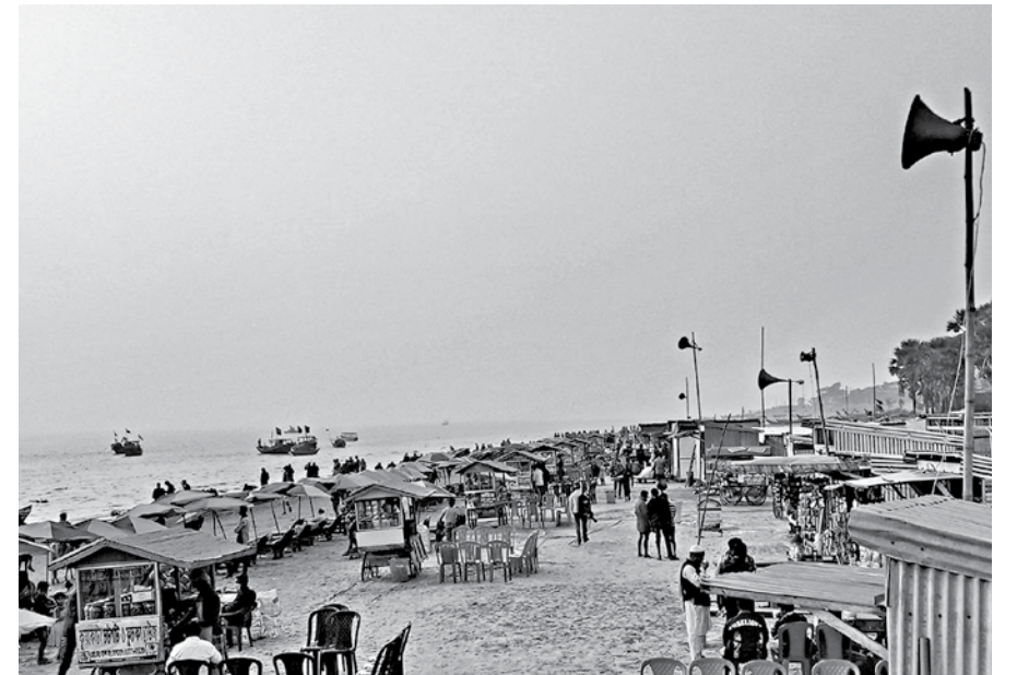
Loudspeakers placed by owners of engine-driven boats affect the hearing power of tourists in Kuakata sea beach of Patuakhali.

Necessary steps will be taken to stop noise pollution, said the UNO.