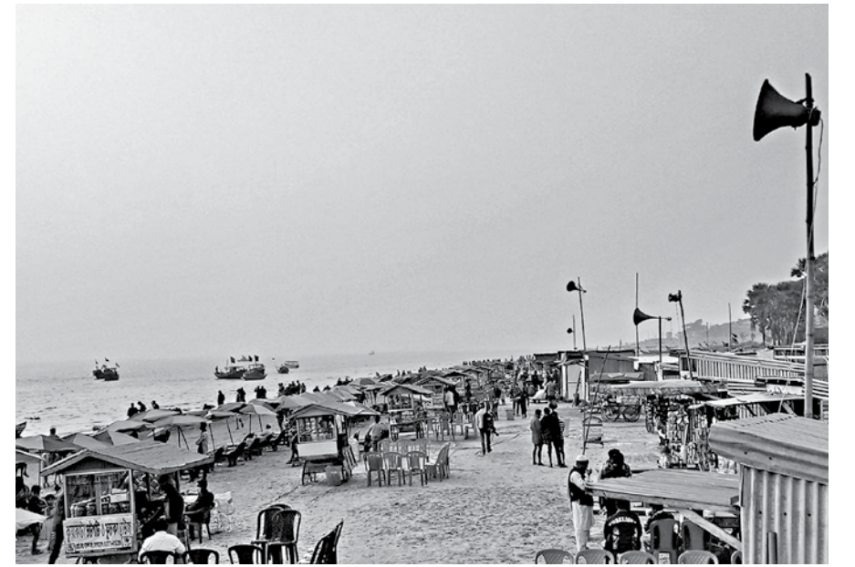
Loudspeakers placed by owners of engine-driven boats affect the hearing power of tourists in Kuakata sea beach of Patuakhali.

Necessary steps will be taken to stop noise pollution, said the UNO.