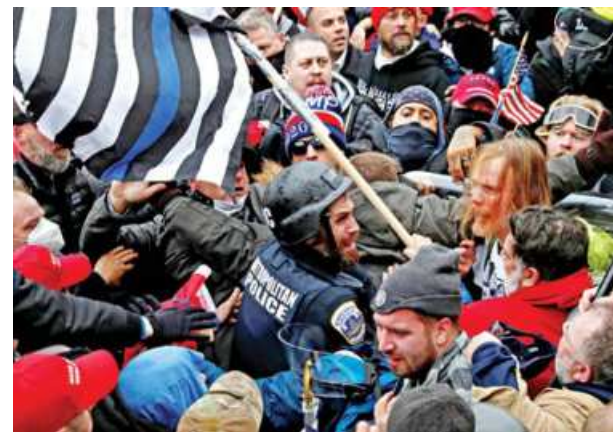
Supporters of US President Donald Trump gather at the US Capitol Building in Washington DC; members of congress run for cover, top right, as protesters try to enter the House Chamber; and pro-Trump mob clash with police, bottom right, outside the US Capitol Building.