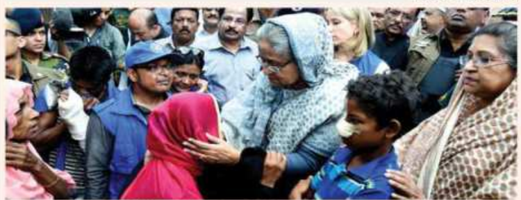
Visit to Kutupalong Rohingya camp