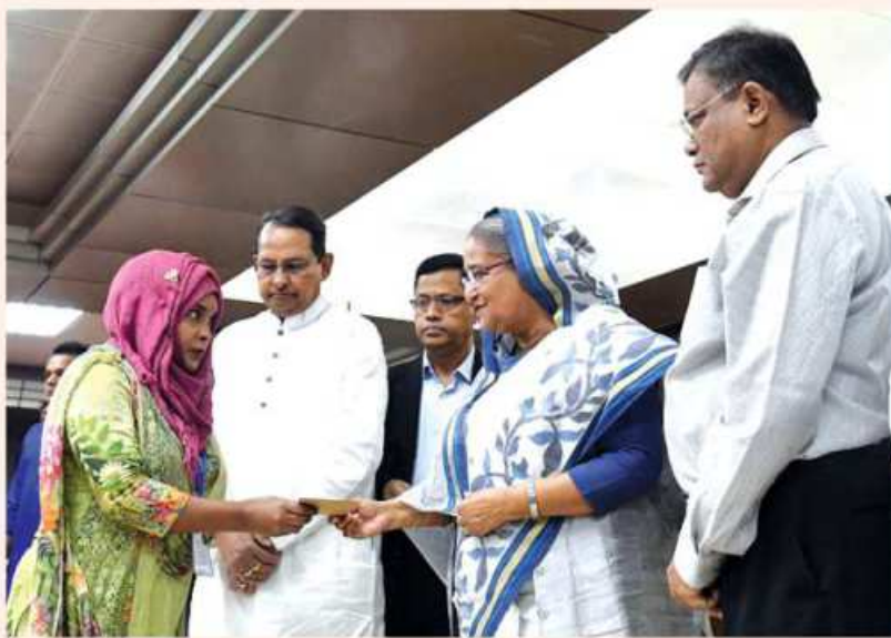
Cheques of financial assistance are being given to the Journalists

The last decade is also characterized by success of poverty reduction. According to BBS estimate, each year on an average poverty has been reduced by one percentage point in the last decade. Extreme poverty also declined by around one percentage point. World Bank estimate