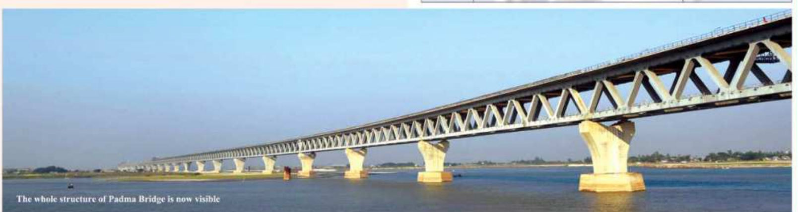
The whole structure of Padma Bridge is now visible