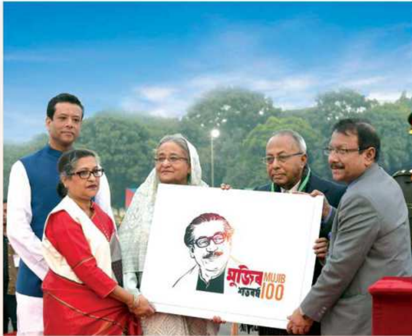
Launching of 'Mujib Borsho' Logo

Since 2009, foreign direct investment increased five times. This will be even accelerated further, if 100 economic zones many of which are under construction and when fully operationalized. In the meantime, some of works already been completed and the flow of investment started poured in. Investors from China, India, Singapore, Japan, and Korea are showing great interest in Bangladesh. Further, mega projects if completed will facilitate buoyant economic activities. The biggest underlying strength of Bangladesh economy is domestic consumption. The market for 165 million people is huge. Perspective Plan 2021-2041 projects foreign direct investment to be around 3 percent of GDP. One of the targets of Vision 2021 was to be self-sufficient in food grain production by 2012. Bangladesh already achieved self-sufficiency in food grain. One of the successes of Bangladesh is more than tripling rice production since Independence.