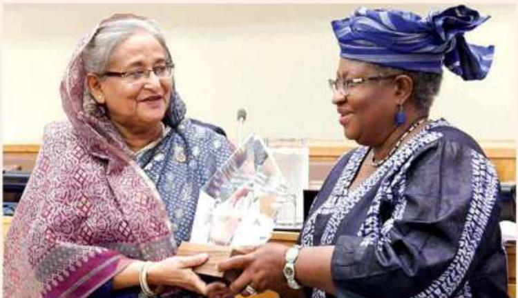
Awarding of 'Vaccine Hero Award' by Global Alliance for Vaccination And Immunization