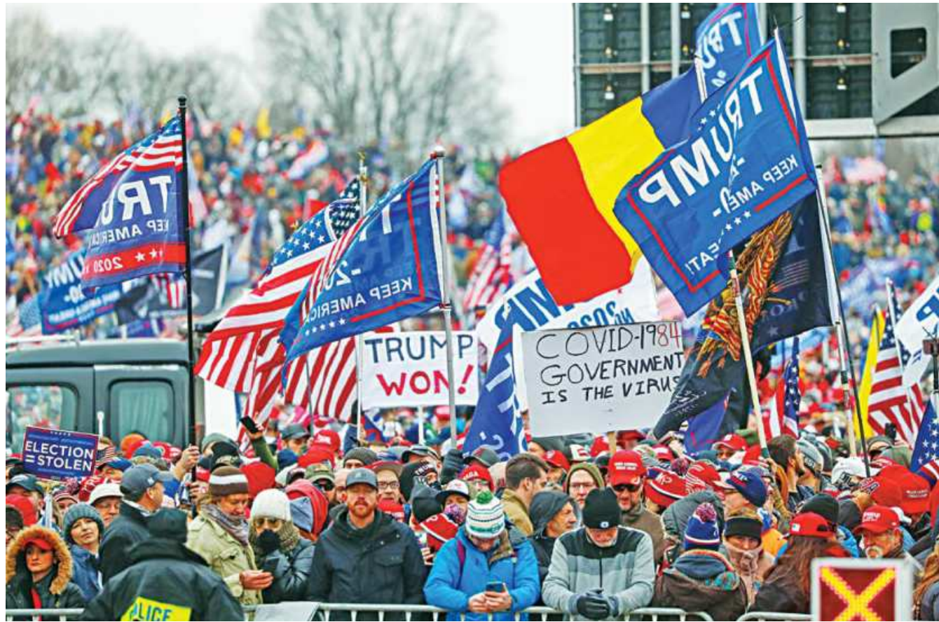
US President Donald Trump's supporters gather for a rally challenging the results of the 2020 US Presidential election on the Ellipse outside of the White House yesterday in Washington, DC. Joe Biden's Democratic Party took a giant step yesterday towards seizing control of the US Senate as they won the first of two Georgia run-offs, hours before Congress was set to certify the president-elect's victory over Donald Trump.