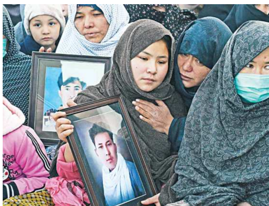
Family members and protesters stage a demonstration against the killing of miners of a Shia Hazara community at the eastern bypass on the outskirts of Quetta, yesterday. Hundreds of mourners in Pakistan protested yesterday for a fourth day alongside the bodies of the miners killed in a brutal attack claimed by the Islamic State group, as officials urged them to bury their dead.