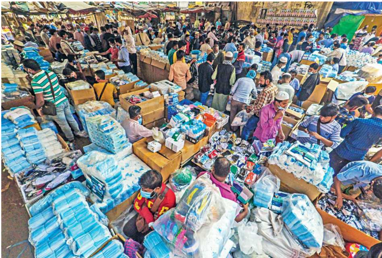
One would think that people who bother to buy and sell masks care about social distancing and other coronavirus rules. But under the Babubazar bridge in Old Dhaka, people form crowds as they buy masks, and some of them have no face covering. The photo was taken yesterday.