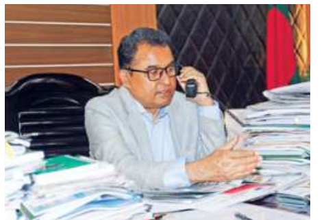
AHM Mustafa Kamal

This is the highest amount of undeclared assets to be legalised in such a short period and was made possible by the government's