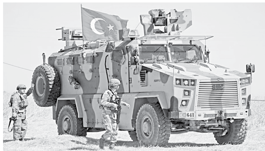
File photo of a Turkish soldier walking next to a Turkish military vehicle during a joint US-Turkey patrol near Tel Abyad, Syria, on September 8, 2019.

argued recently that the UAE's hard power and coercive efforts to block Turkish advances had failed. Those efforts included military backing of Libyan rebel leader Khalifa Haftar and threats to sanction Algeria for its stepped-up cooperation with Turkey.