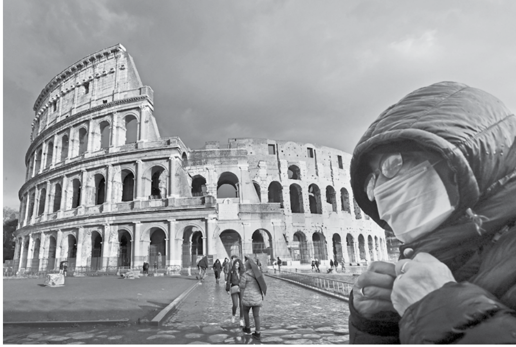
File photo of a man wearing a mask passing by the Coliseum in Rome, on March 7, 2020.

Now that we have reached this critical juncture, speculation about whether COVAX will fail must stop. It is time to start providing the support needed to ensure that it succeeds in doing what