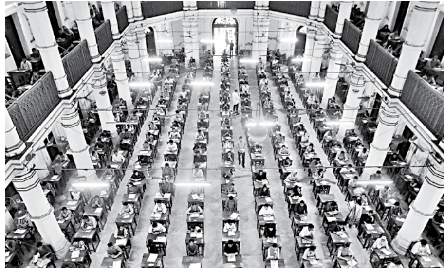
A uniform admission test for all public universities is the need of the hour, but care must be taken to address the concerns of relevant departments and protect the interests of the candidates of all groups.