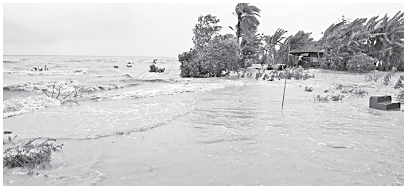
File photo of coastal areas in Patuakhali being inundated during cyclone Amphan.

The first point to make is that the two issues are closely related as SDG 13 is about reaching the climate change goals from the Paris Agreement as well. It is also true that the climate change goals can be reached only if the other main SDGs are met at the same time. This means, we need to take a much more integrated approach to our development pathways and investments. It's also important to note that in terms of dealing with the additional public health crisis and economic downturn caused