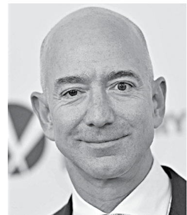
Amazon CEO Jeff Bezos

The US is the only major world economy that does not provide universal medical coverage to its citizens, and healthcare costs have spiraled upwards for decades, accounting for 17.7 percent of GDP high-quality and transparent health in 2019, according to the Centers