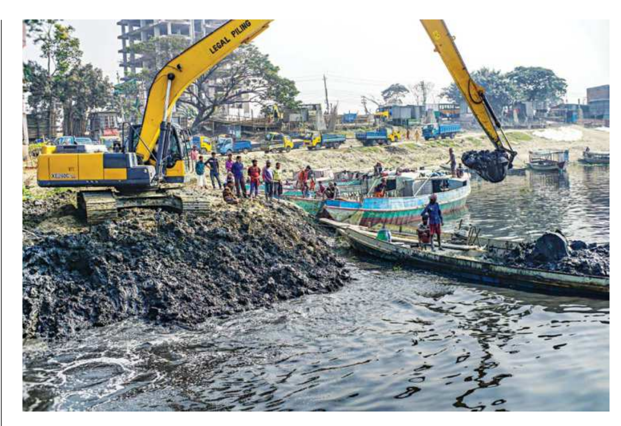
Workers of the BIWTA excavating sediment to increase the navigability of the Turag river in and around its Mirpur's Diabari landing station yesterday. The soil is later sold.