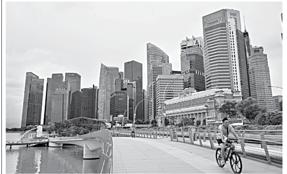
A man cycles along a bridge in Singapore yesterday.

Singapore's small economy is typically hit first by external shocks before ripples spread across the region. However, it usually also recovers quickly from any downturn.