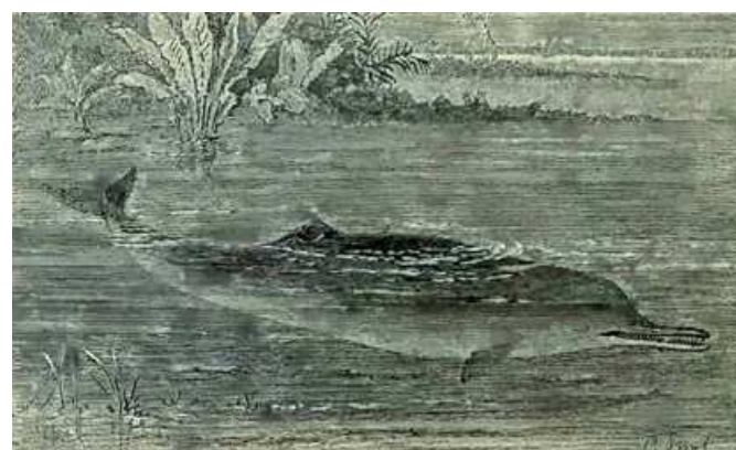
Gangetic dolphin of the Sunderbans, drawing from 1894

grants already made, besides the revenue of the 100,000 biggas he would be able to give in 1790, which would be Rs. 12,500 in 1793, and Rs. 50,000 in 1203 1796. The names of the grants are given in the same letter; they almost all have names derived from those of the grantees—"Kalidaspur," "Muhammadabad," "Bhairabnagar," and so forth. The first two of these were apparently the most