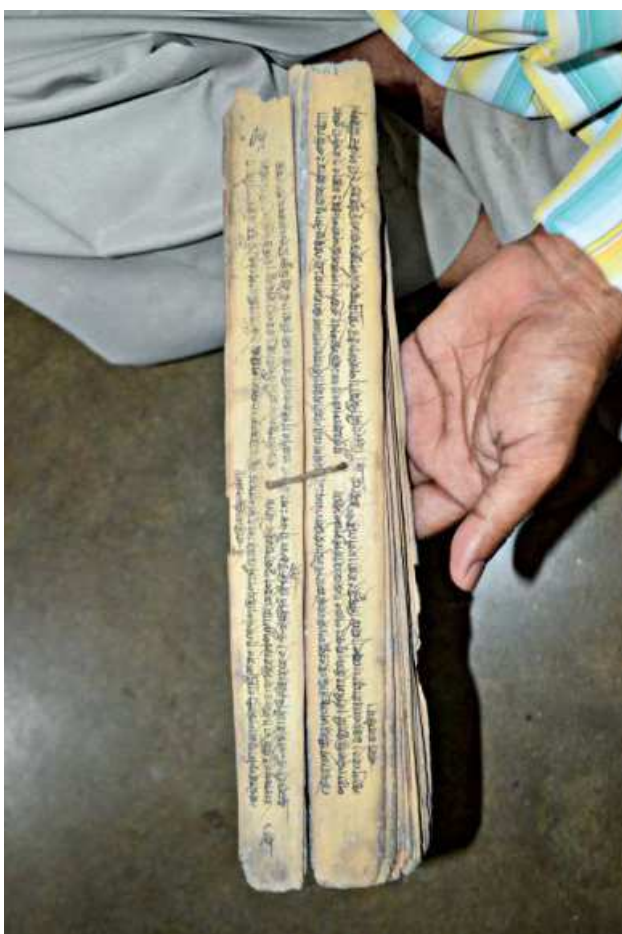
Puthis collected from the Sundarban.