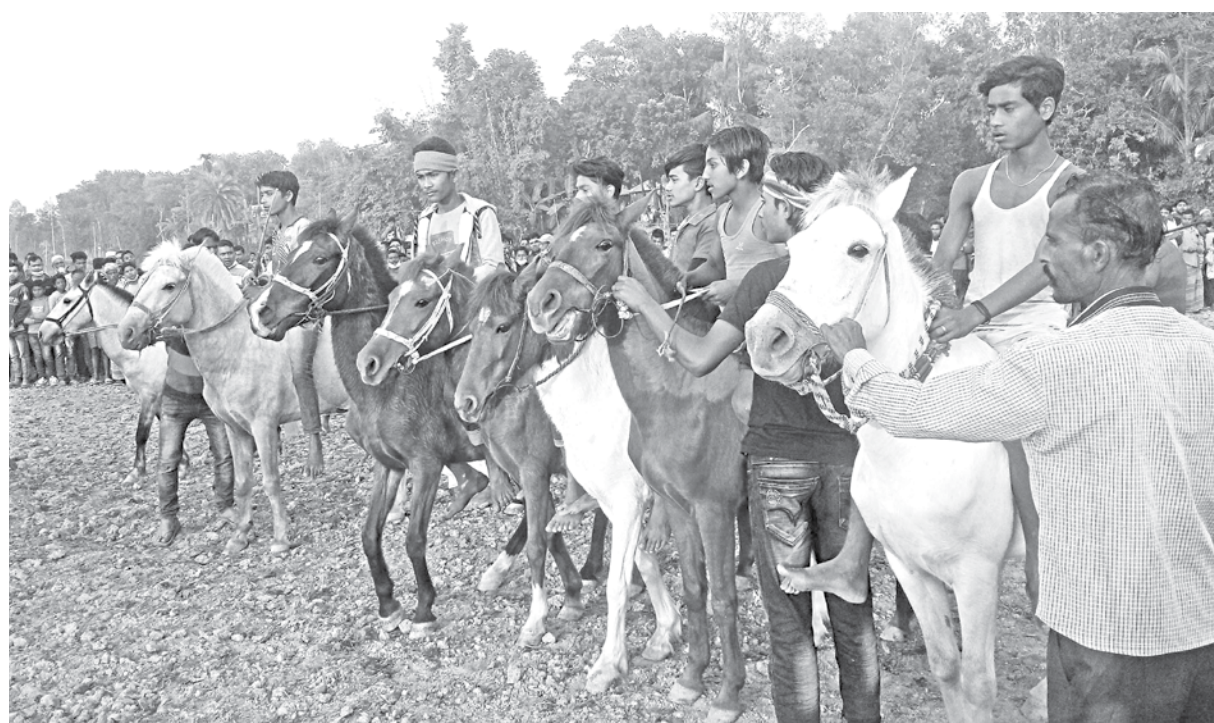
A traditional horse race was held in Tangail's Nagarpur upazila yesterday amid festive mood. Several thousand locals and people of different neighbouring villages came to enjoy the event, organised at Dakkhinpara ground in Chechujani village of the upazila.

Victims claimed that the extent of loss caused by the fire could go up to Tk 12 lakh.