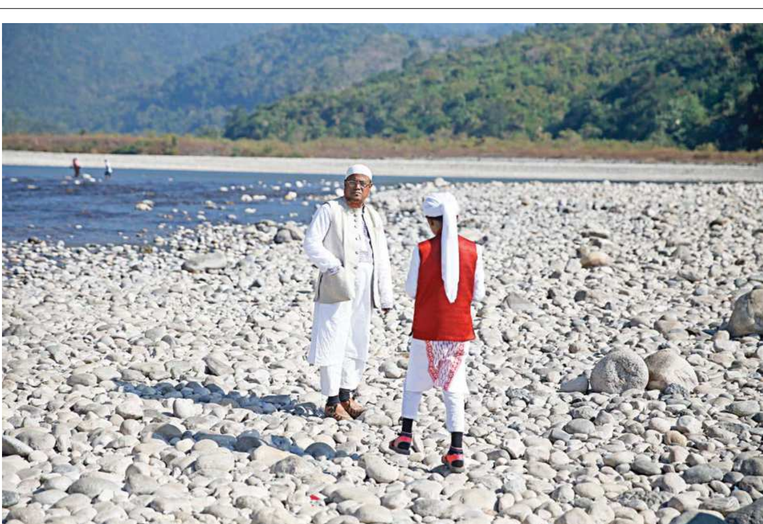
Sada Pathor in Sylhet's Bholaganj, a new favourite for tourists, hasn't seen many souls last year due to the pandemic. But as tourism is slowly coming back to life, people are once again starting to visit this bed of white stones leading to crystal-clear water. This photo was taken over the weekend.