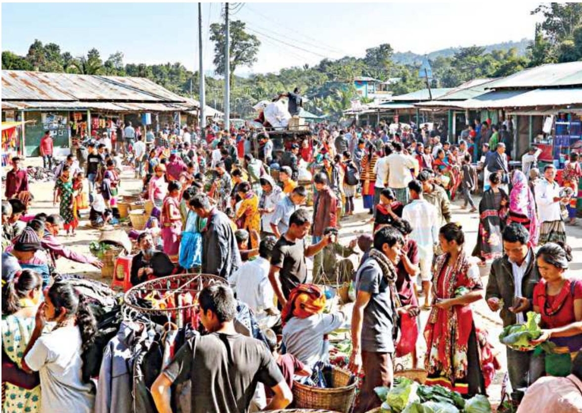
People reluctant to wear masks are somewhat ubiquitous across the country. But the fact that almost no one seen in the photo, taken yesterday at Masalong Bazar, Rangamati, has a face covering is simply alarming.