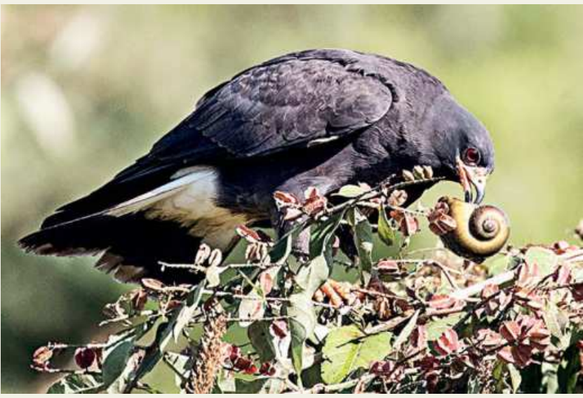
Snail Kite and Snail, Pantanal, Brazil.