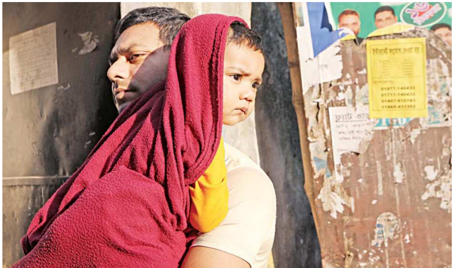
A baby boy's curious face peaks out of his bright red cloak during a winter morning walk in his father's arms. They were out basking in the sunlight in the early hours of the first day of the new year at Tejkunipara in the capital.