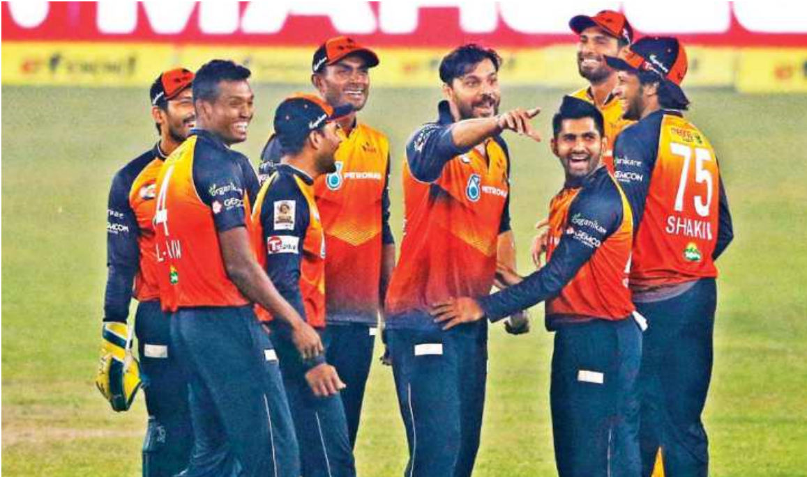
Gemcon Khulna players joined in the fun with Mashrafe Bin Mortaza, who returned career-best T20 figures of 5 for 35 to dismantle Gazi Group Chattogram innings in the qualifier 1 of the Bangabandhu T20 Cup in Mirpur yesterday.