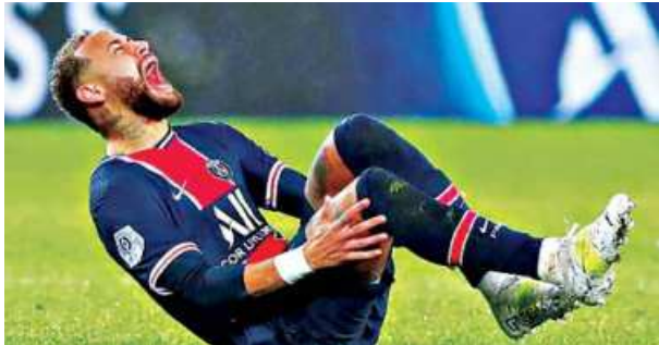
Neymar sustained a left ankle injury following a heavy tackle from Thiago Mendes, who was then red carded, during PSG's 1-0 home defeat against Lyon. "No news about Ney(mar)," PSG coach Thomas Tuchel said after the game on Sunday.

After an insignificant playing career in France's lower leagues, Houllier began coaching in 1973, earning his first big job with Lens before taking over at Paris St Germain. He became France's assistant coach in 1988 and then manager in 1992 but had a short, unsuccessful spell in charge.