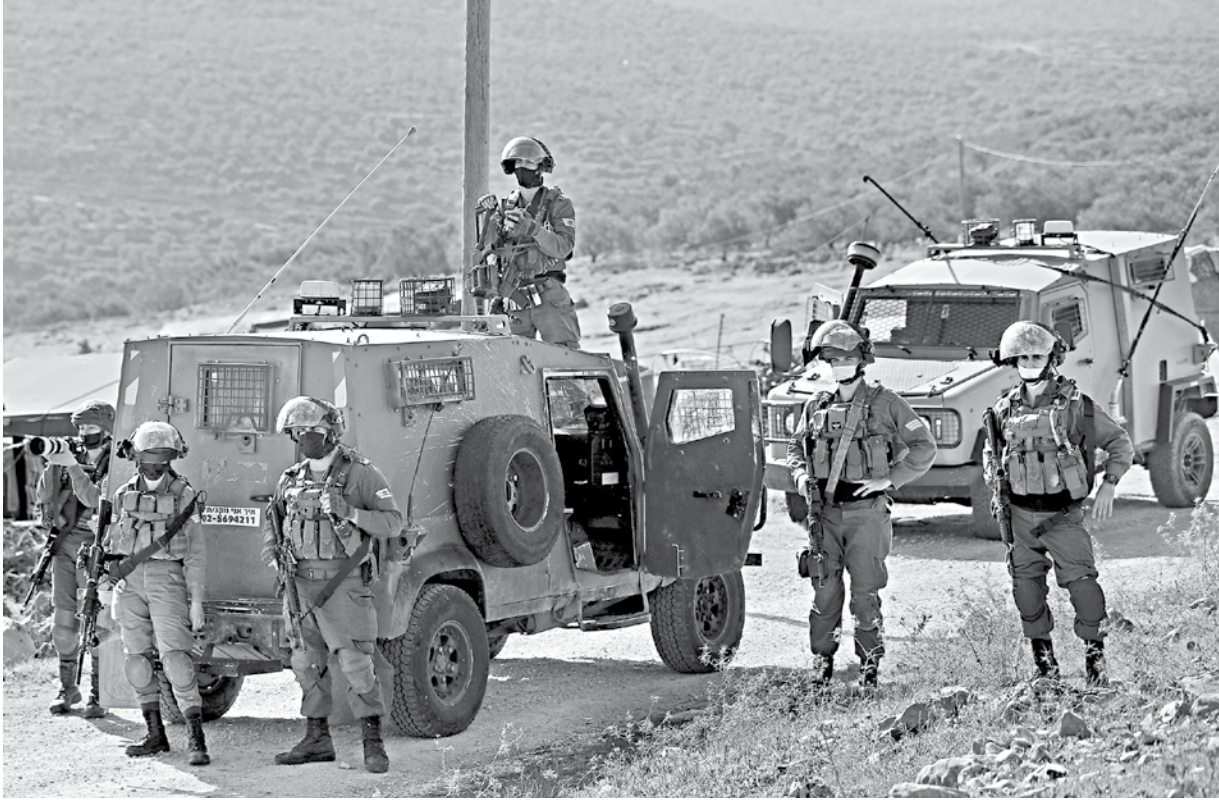
Israeli soldiers stand guard during a Palestinian protest against Jewish settlements in Salfit in the Israeli-occupied West Bank yesterday.