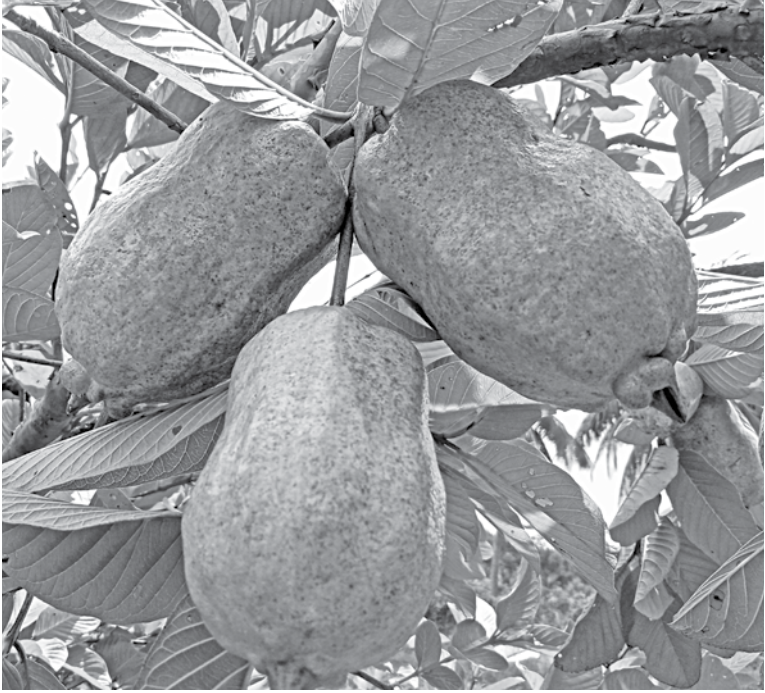
The seedless guavas hang from the branches. The photo was taken from Raikhal Hill Agricultural Research Institute in Kaptai upazila of Rangamati recently.

The shape of the fruit is elongated, the shell is white and it is sweet to eat and crispy. It is high yielding and off-season guava variety. Flowers come in June. The size of the fruit is 7.14cm to 10.14cm. The average weight of the