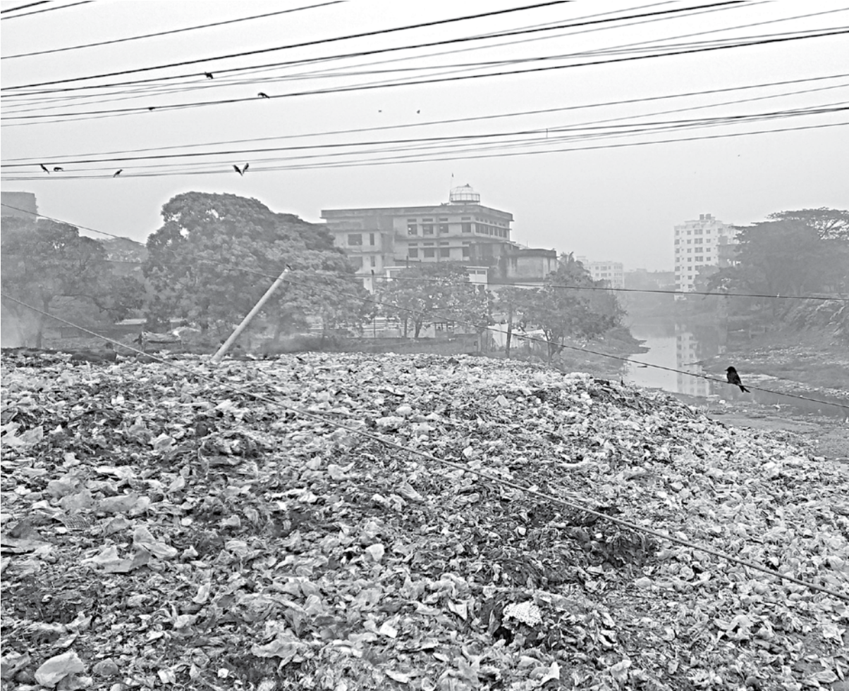
Piles of garbage are left on the bank of Karnapara canal near Dhaka Aricha-highway in Savar, polluting and shrinking the waterbody. The photo was taken on Wednesday.