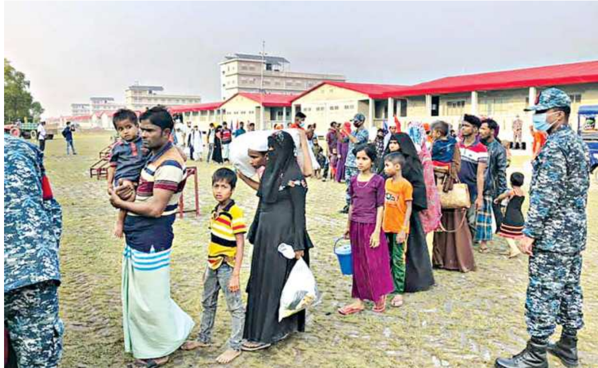
A group of Rohingyas enters a field in front of a warehouse in Noakhali's Bhasan Char yesterday to attend a special prayer to mark their arrival on the island. Bottom left , Rohingyas arrive at Patenga ghat-15 in Chattogram city. Bottom right , forcibly displaced Myanmar nationals onboard a Navy ship leave the port city for Bhasan Char. A total of 1,642 Rohingyas reached the island yesterday in the first phase of relocation of refugees from Cox's Bazar.