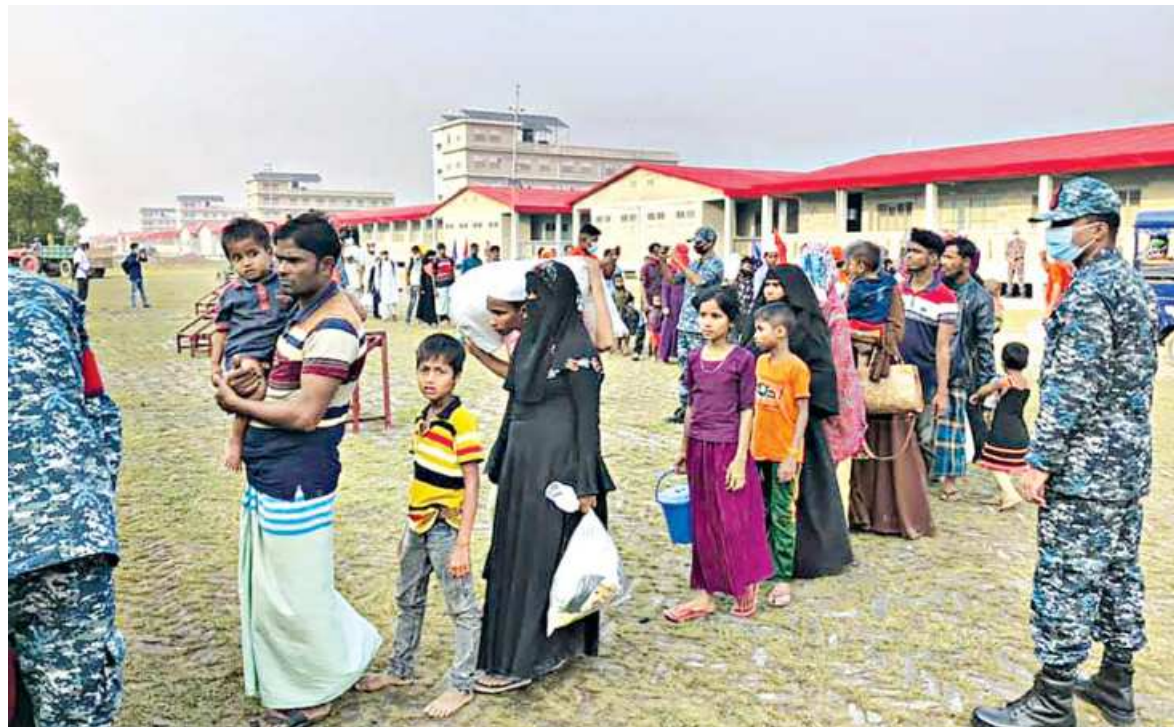
A group of Rohingyas enters a field in front of a warehouse in Noakhali's Bhasan Char yesterday to attend a special prayer to mark their arrival on the island. Bottom left , Rohingyas arrive at Patenga ghat-15 in Chattogram city. Bottom right , forcibly displaced Myanmar nationals onboard a Navy ship leave the port city for Bhasan Char. A total of 1,642 Rohingyas reached the island yesterday in the first phase of relocation of refugees from Cox's Bazar.