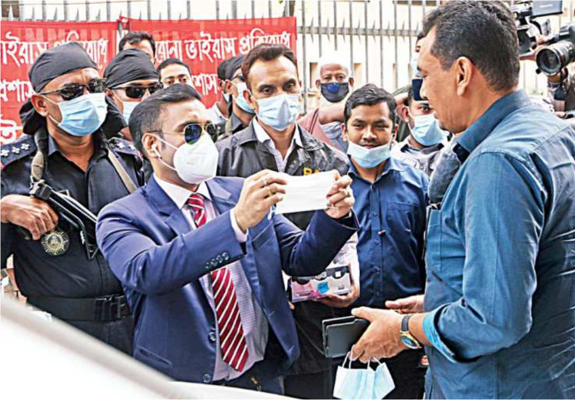
An executive magistrate of Rab gets ready to place over the face of a person not wearing a mask at Shahbagh intersection yesterday. Covid-19 cases and deaths have been on the rise recently, and experts say the coming winter may worsen the situation. Authorities are also conducting drives to ensure people are following the health guideline.