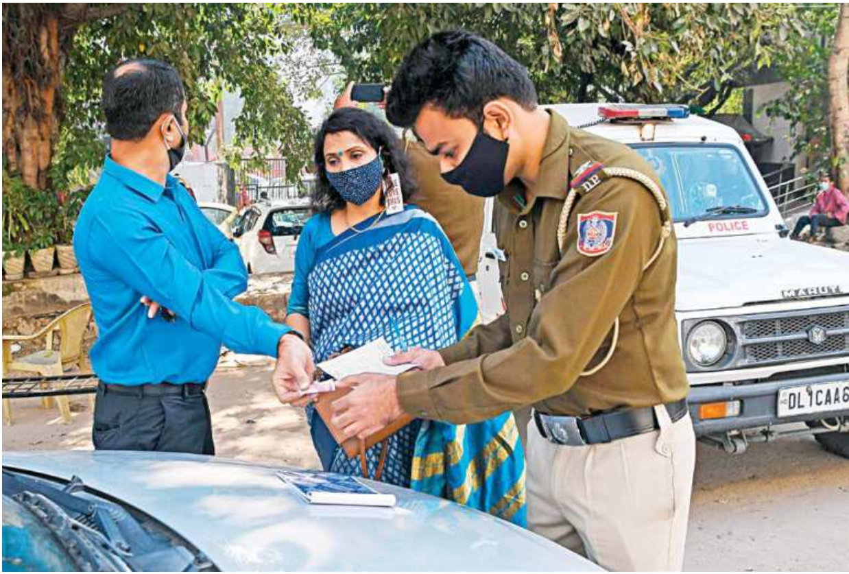
A policeman fines a commuter for not wearing facemask as a preventive measure against the coronavirus, while travelling in car in New Delhi, India yesterday.