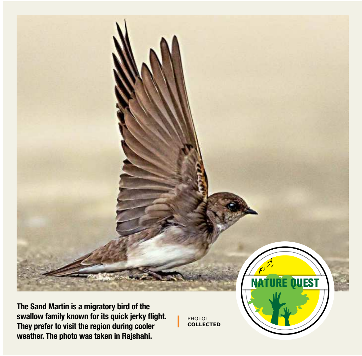
The Sand Martin is a migratory bird of the swallow family known for its quick jerky flight. They prefer to visit the region during cooler weather. The photo was taken in Rajshahi.