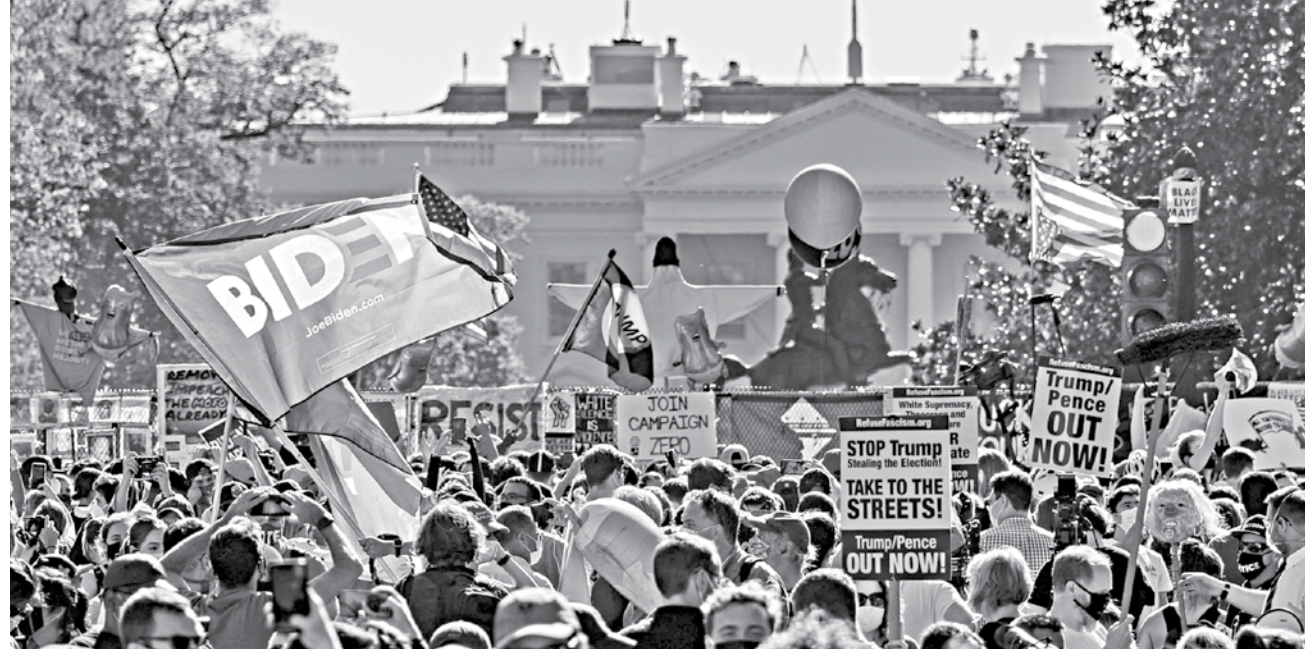
People celebrate on Black Lives Matter plaza across from the White House in Washington, D.C. on November 7, 2020, after Joe Biden was declared the winner of the 2020 US presidential election.