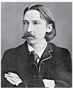
ROBERT LOUIS STEVENSON (1850-1894)