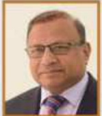
Md Tazul Islam, MP Hon'ble Minister, Ministry of Local Government, Rural Development and Co-operatives

Digital Centres are emerging as one-stop service centres for developing the living standard of the marginalized.