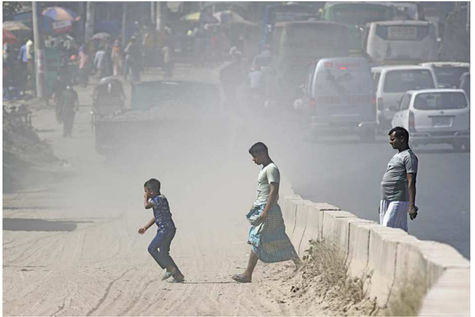
Dust kicked up by vehicles makes life difficult in Amin Bazar Truck Stand area beside Dhaka-Aricha highway. Vessels carry sand via the Turag and offload it to trucks at Amin Bazar. The vehicles usually drop some of their cargo as they travel on the highway, leading to the dust problem. The photo was taken yesterday.