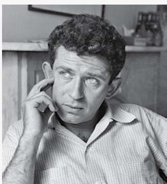
NORMAN MAILER (1923-2007) American novelist and journalist.

Harsh words live in the dungeon of the heart.