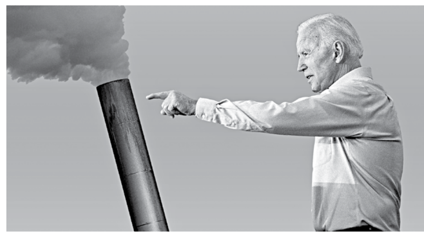
ILLUSTRATION: SARAH GRILLO/AXIOS

President Biden in 2015, all countries are supposed to submit their revised plans for enhancing their reduction in emissions of greenhouse gases by December 31, 2020. Because Biden won't be sworn in as president until January 20, 2021, we can allow him an extension of a few weeks to submit the US Nationally Determined Contribution (NDC) where they have to say by when they will be able to reach net zero emissions of greenhouse gases. The good news is that already