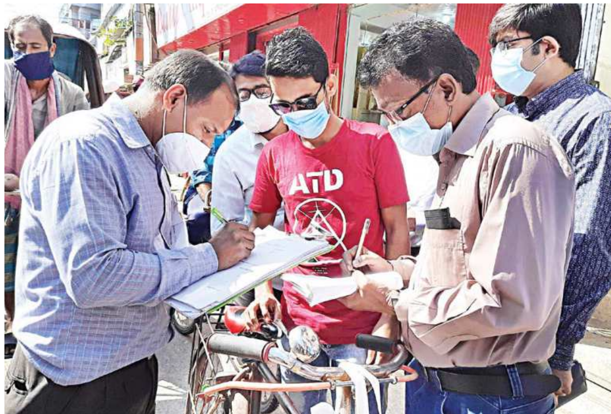
A mobile court of the Khulna district administration fines a cyclist Tk 500 for not wearing a mask at Dakbanglo intersection in the city yesterday. He later put on his mask. Mobile courts detained 33 people and fined 64 during drives in the district to enforce Covid-19 health guidelines.