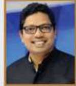
Zunaid Ahmed Palak, MP Hon'ble State Minister ICT Division

People should not have to visit government offices to access public services. My dream is to deliver services at citizens' fingertips.