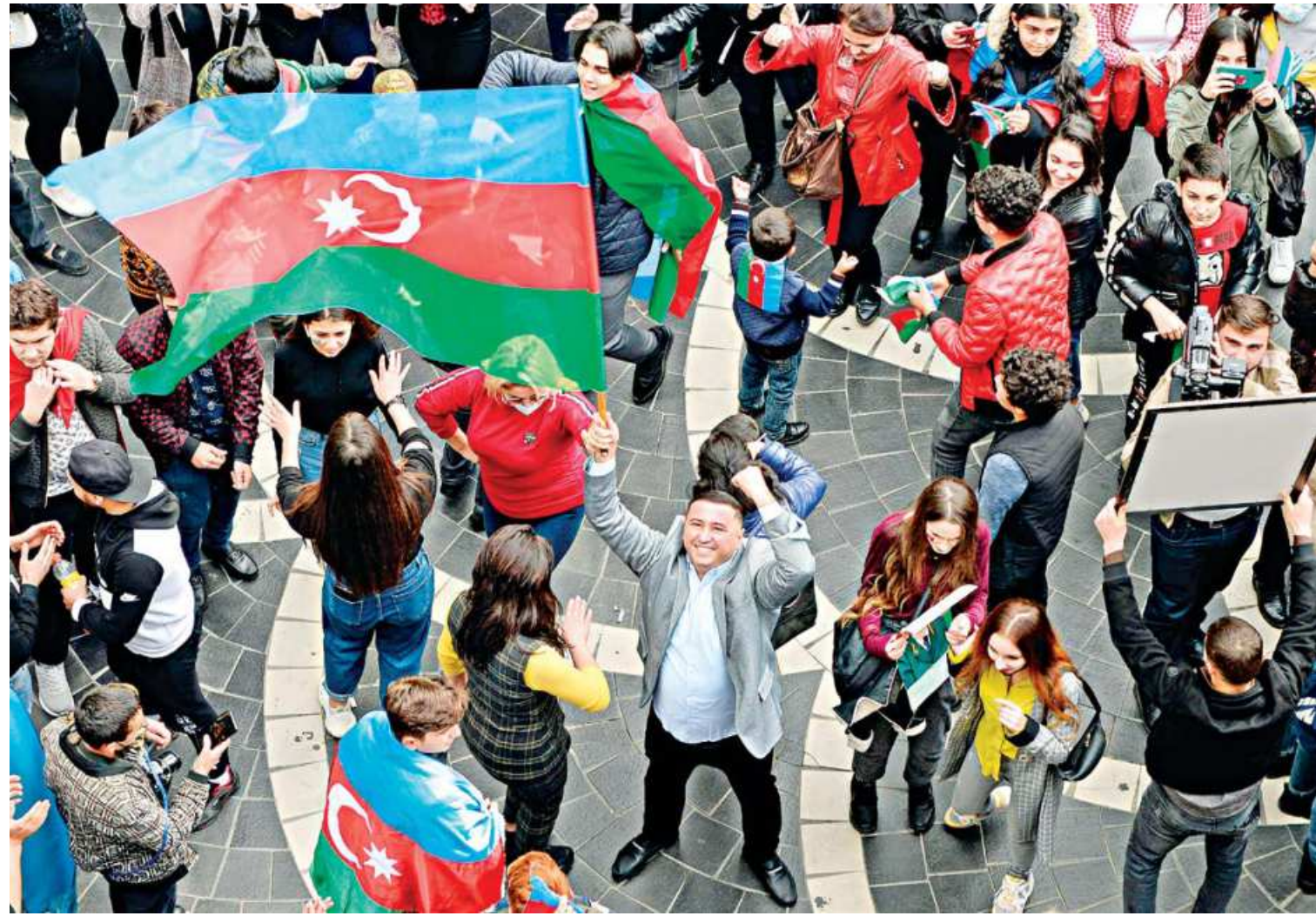
Azerbaijanis wave the national flag as they celebrate in the streets of the capital Baku yesterday, after Armenia and Azerbaijan agreed a ceasefire following a string of Azeri victories in fighting over the disputed Nagorno-Karabakh region.

The election had taken place after a bitter campaign that saw Nitish Kumar battling anti-incumbency, a rebellion by Lok Janshakti Party's Chirag Paswan against his leadership -- seen by many as being backed by BJP. Paswan's rebellion, which has cut into Nitish Kumar's votes, has hugely benefitted the BJP.