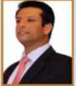
Sajeeb Wazed Hon'ble ICT Affairs Advisor to the Hon'ble Prime Minister

Digital Centres are emerging as one-stop service centres for developing the living standard of the marginalized.