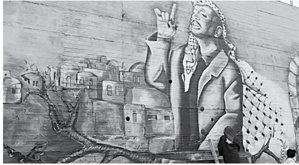
Palestinian university art students work on a mural depicting late Palestinian leader Yasser Arafat in the West Bank city of Nablus.