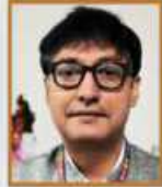
Sudipto Mukerjee Resident Representative UNDP Bangladesh

Digital Centres are now being hailed as a model for service delivery.