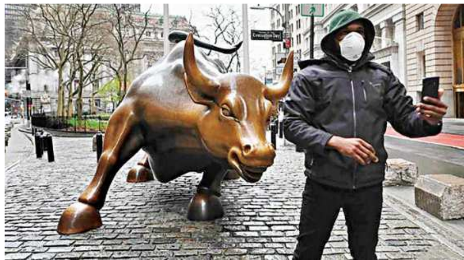
There are clear signs the economic recovery is in full swing. Last quarter, the GDP registered a whopping 33.3 percent growth rate and the unemployment rate dropped to 6.9 percent in October.

Thirdly, Biden has promised to take the US back to the Paris Climate Agreement, ban fracking, and come down hard on carbon emissions. The Department of Justice and the Environmental Protection Agency is likely to once again enforce the Clean Air Act, the Clean Power Plan, and other executive orders to regulate coal-fired power plants and fossil fuels.