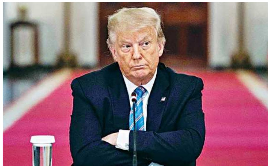
US President Donald Trump.