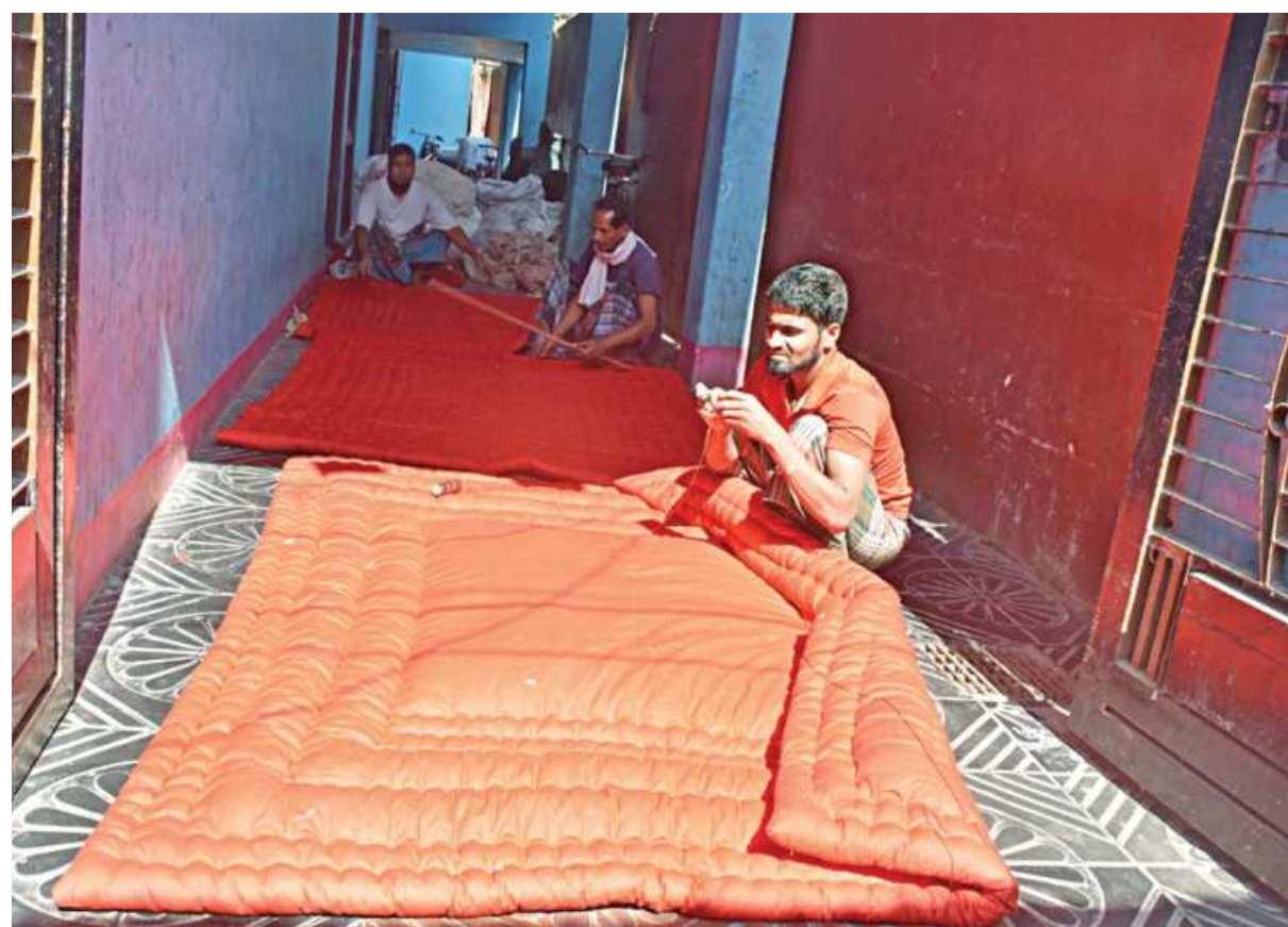
The onset of winter ushers in a busy few months for quilters, as demand for comforters hit the sky. This photo was taken yesterday from Barishal city's Padmabati area.