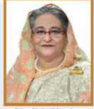
Sheikh Hasina Hon'ble Prime Minister of the Government of the People's Republic of Bangladesh

...এ স্বাধীনতা আমার পূর্ণ হবে না যদি এদেশের মানুষ যারা আমার যুবক শ্রেণী আছে তারা চাকরি না পায় বা কাজ না পায়। ... this freedom will not be complete if the youth of this country do not get jobs or work.