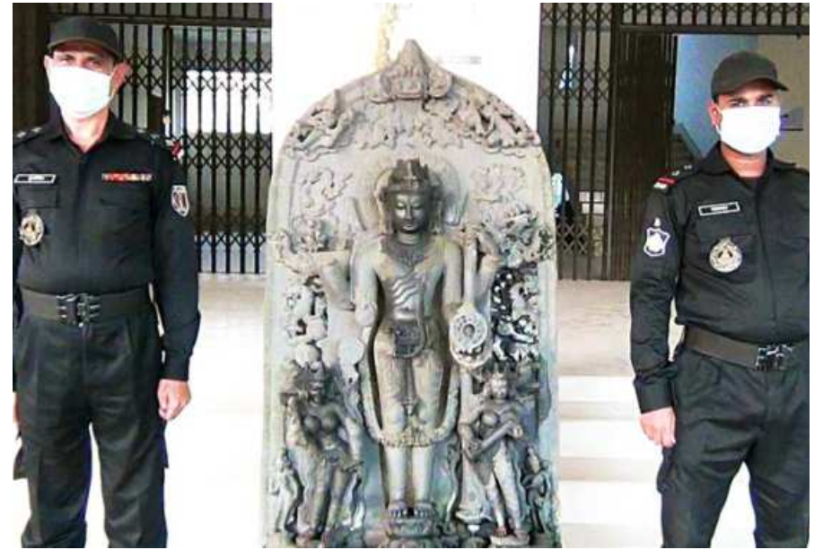
Rapid Action Battalion (Rab) on Sunday seized this touchstone statue of Hindu god Vishnu, weighing 380 kilograms, from Dewra village in Joyprhat's Akkelpur upazila.

They also seized 16 mobile phone sets and 27 SIM cards from them.