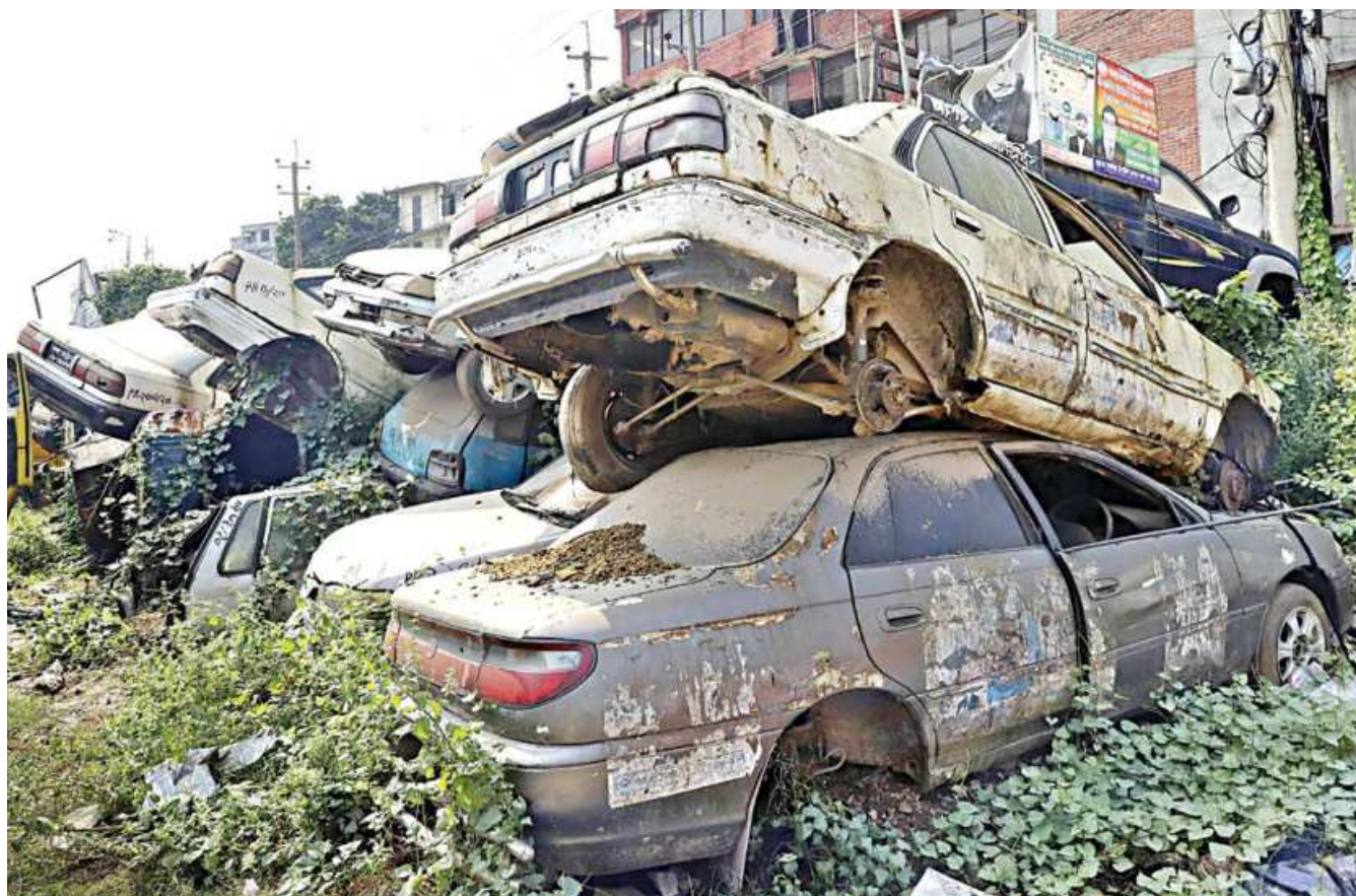
Vehicles seized by law enforcers have been piled up in front of Ashulia Police Station in Savar. Storing vehicles in the open causes them to get ruined. In many countries, vehicles are impounded in sheds where they are protected from the elements and theft. The photo was taken recently.