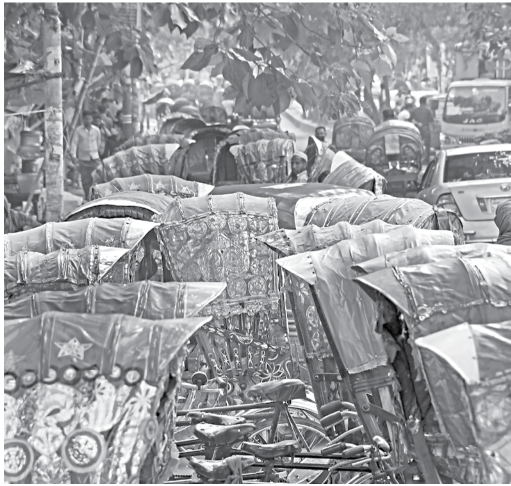
Lines of rickshaws remain parked on the capital's Green Road all day, narrowing the space for vehicular movement, which often results in traffic congestion on the busy road. Encroachment of road space is a common scene in Dhaka, with little effort from authorities concern to address the public nuisance. The photo was taken earlier this week.

About the atmosphere in the by-polls to Dhaka-18 and Sirajganj-1, he said law enforcers are raiding the houses of BNP leaders and activists at night and threatening their family members of dire consequences if they stay in their areas.