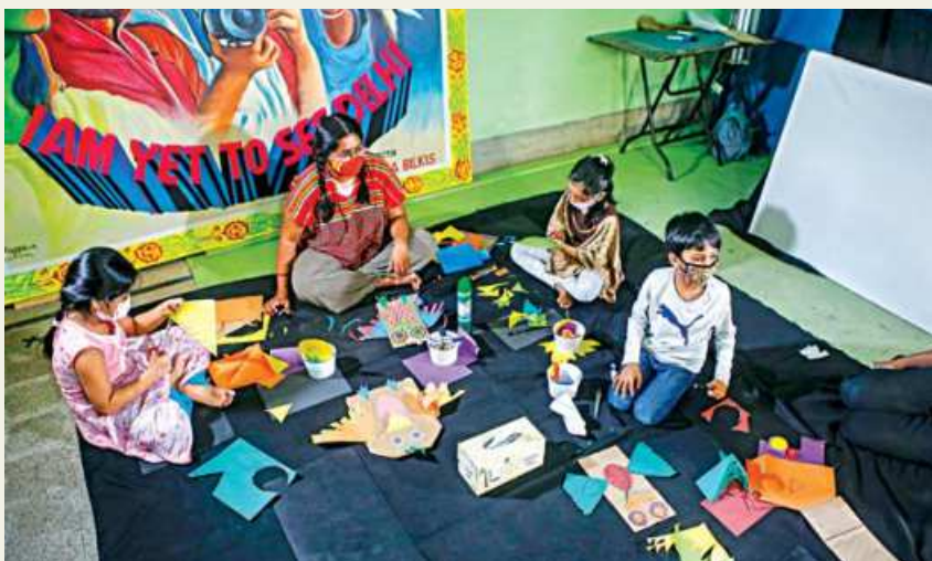
The school offers courses that will teach youngsters everything about the craft of puppeteering, on stage and behind it.

Jolputul inaugurates puppet school in capital