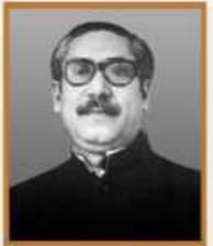
Father of the Nation Bangabandhu Sheikh Mujibur Rahman

...এ স্বাধীনতা আমার পূর্ণ হবে না যদি এদেশের মানুষ যারা আমার যুবক শ্রেণী আছে তারা চাকরি না পায় বা কাজ না পায়। ... this freedom will not be complete if the youth of this country do not get jobs or work.