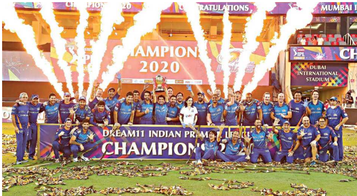
Mumbai Indians players celebrate with the IPL trophy after winning the final against Delhi Capitals at the Dubai International Cricket Stadium yesterday.

Norway v Israel Live from 11:00pm Germany v Czech Republic Live from 1:45am (Thursday)