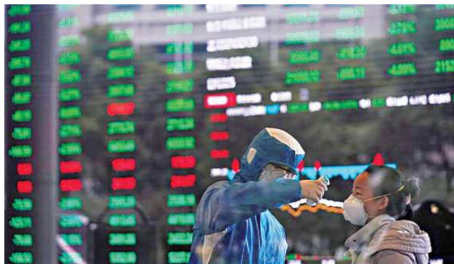
A worker in protective suit takes body temperature measurement of a woman inside the Shanghai Stock Exchange building, at the Pudong financial district in Shanghai, China.

Analysts attributed the decline to the heavy exposure of China's indices to tech stocks, which came under pressure as