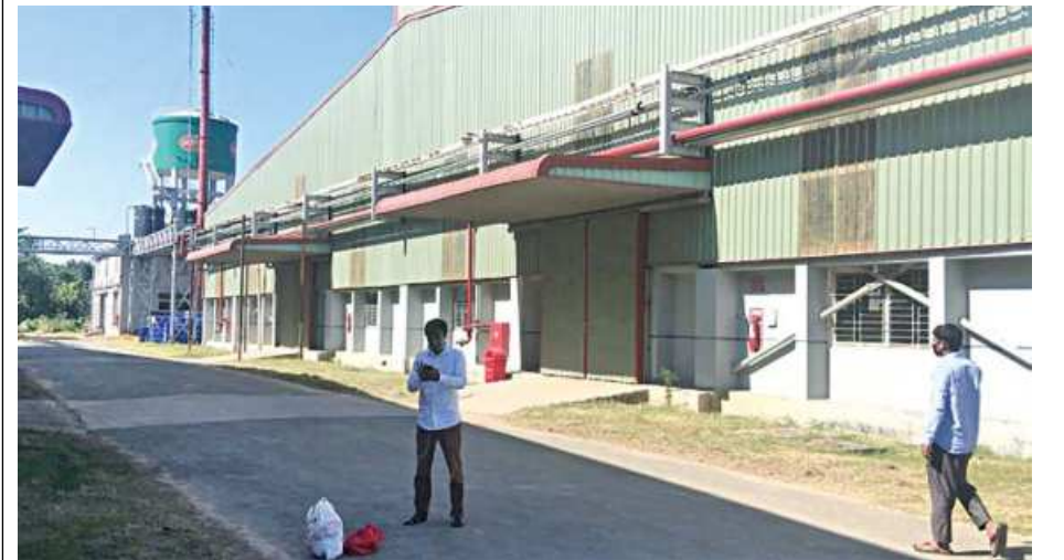
People are seen in front of Pran-RFL Group's Barind (Varendra) Industrial Park at Godagari, Rajshahi yesterday.

Honor is one of several brands aiming to turn their phones into control centers for internet-connected devices such as home appliances, to capture a potential market for future growth.