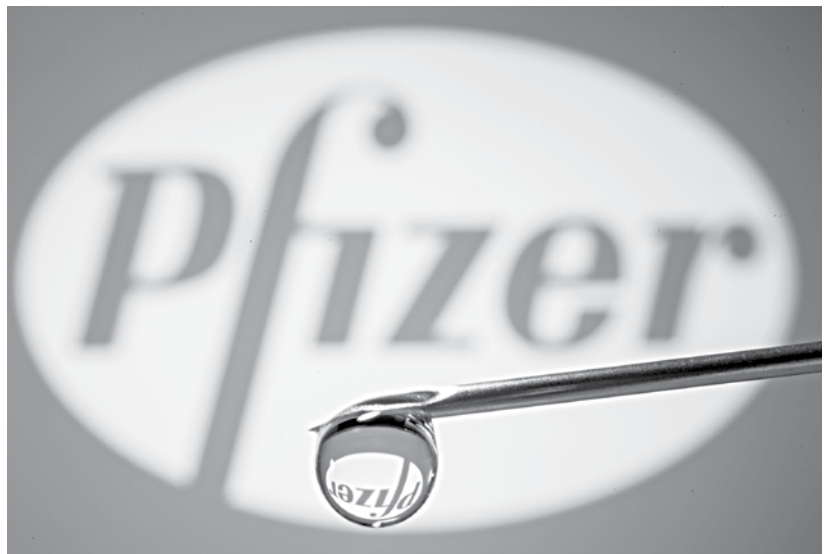
Pfizer's logo is reflected in a drop on a syringe needle in this illustration.

The World Health Organization called the results very positive but