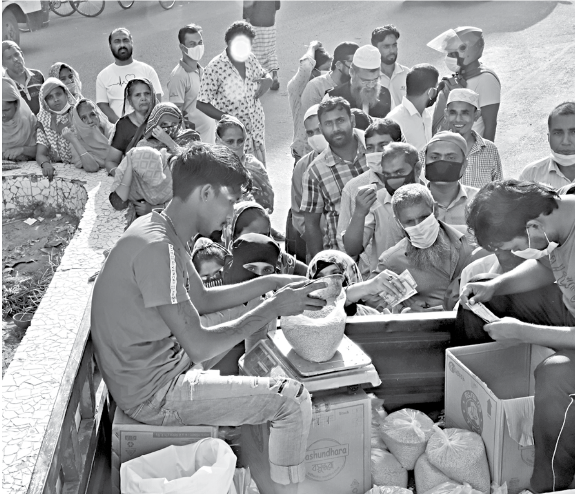
Buyers queue up to buy groceries from a Trading Corporation of Bangladesh (TCB) truck in the capital's Motijheel. The open market sales come at a cheaper price than market rates, but every buyer can also get only a fixed maximum amount. This is why staffers carefully weigh items such as lentils for each purchase. This photo was taken yesterday.

Law enforcers eventually brought the situation under control.