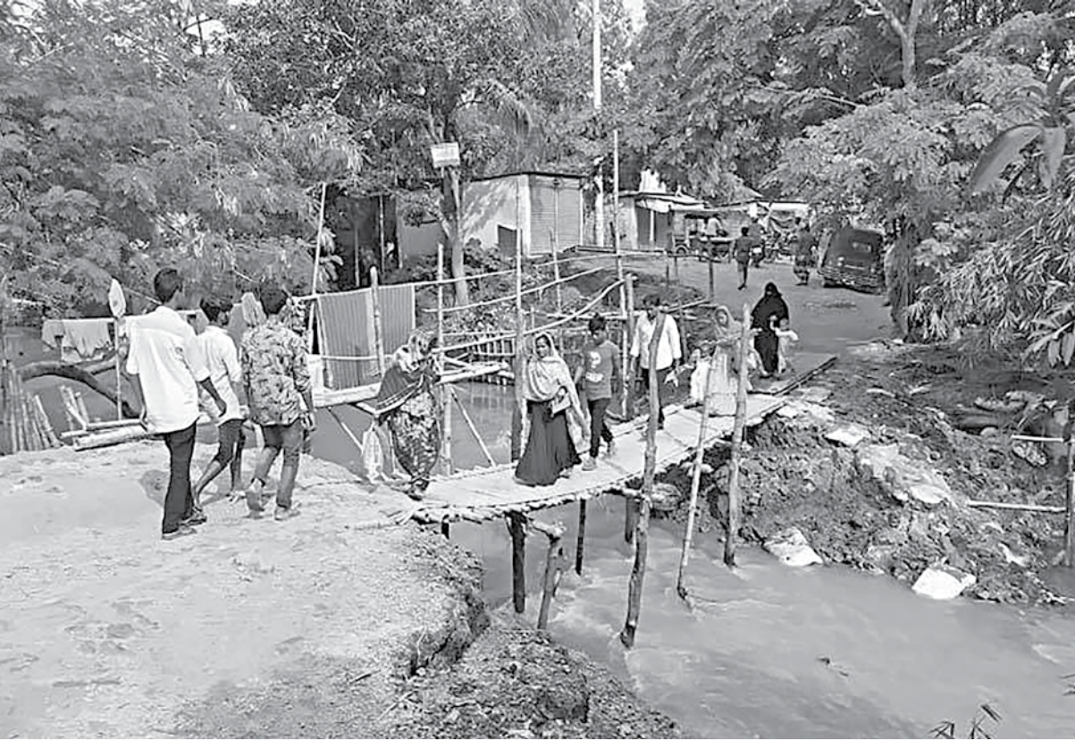
Construction work of a concrete bridge over the canal in Tangail's Nagarpur upazila is going on at a slow pace, much to the sufferings of commuters. Local people are now crossing a bamboo bridge there amid risk.