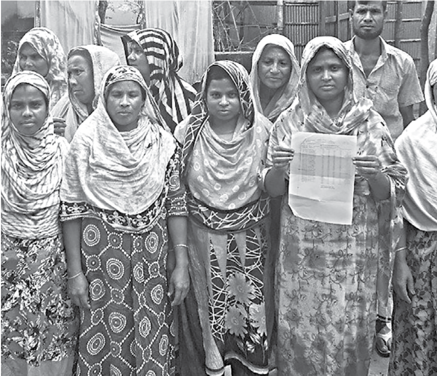
Several of the women whose identities were used to embezzle Tk 2.38 lakh meant for the poor, under the 'Amar Bari, Amar Khamar' initiative of the government, in Nilphamari's Kishorganj upazila.