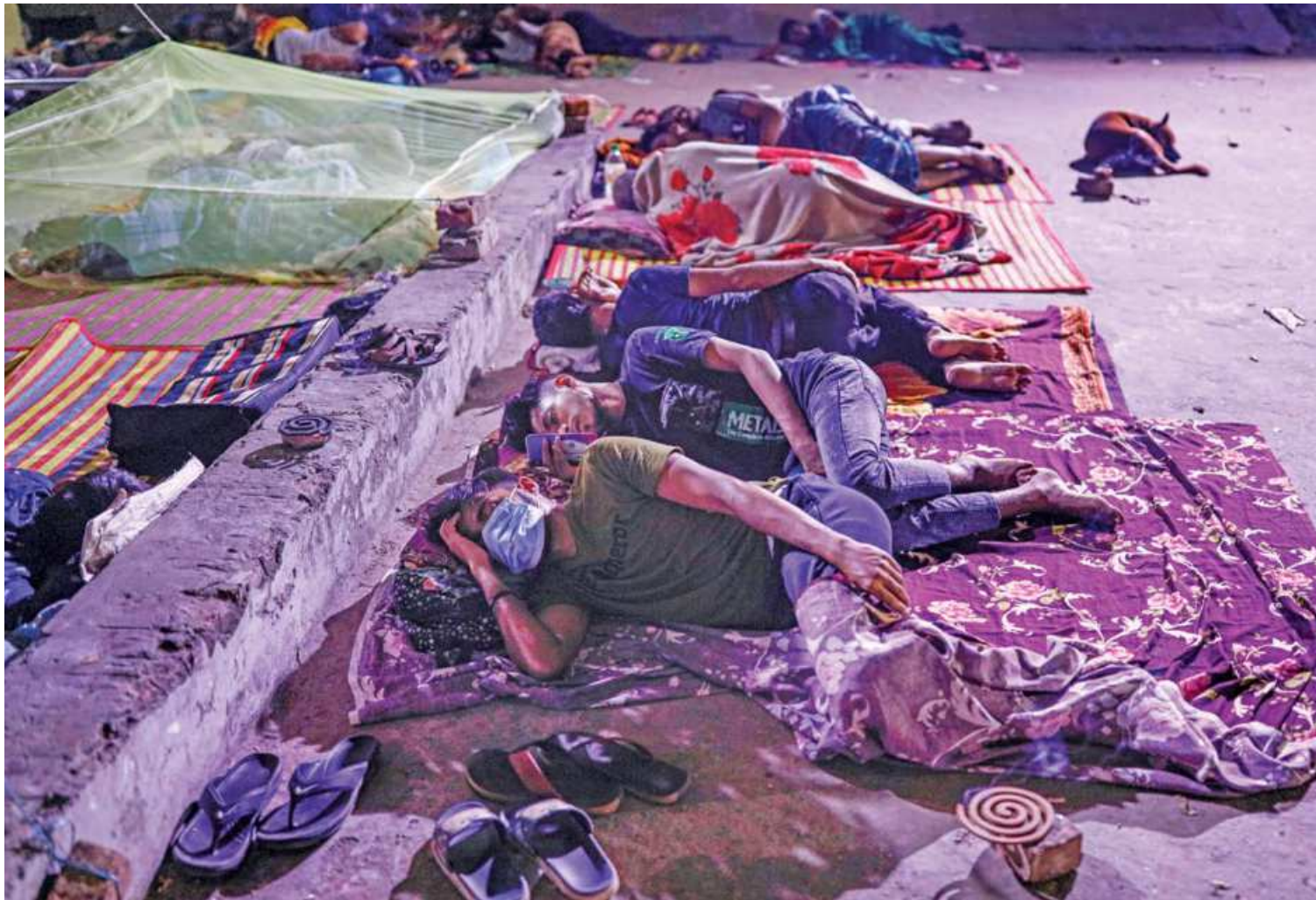
People, mostly fathers of newborns, sleeping under the open sky with their children and relatives admitted at the Agargaon Shishu Hospital in the capital. The hospital allows only one attendant with patents inside their territory. Many of these people came from other districts and have no place to stay in the capital. The photo was taken recently.