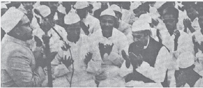
Prime Minister Sheikh Mujibur Rahman offering his Eid prayer at Dhanmondi Maidan on November 8, 1972.