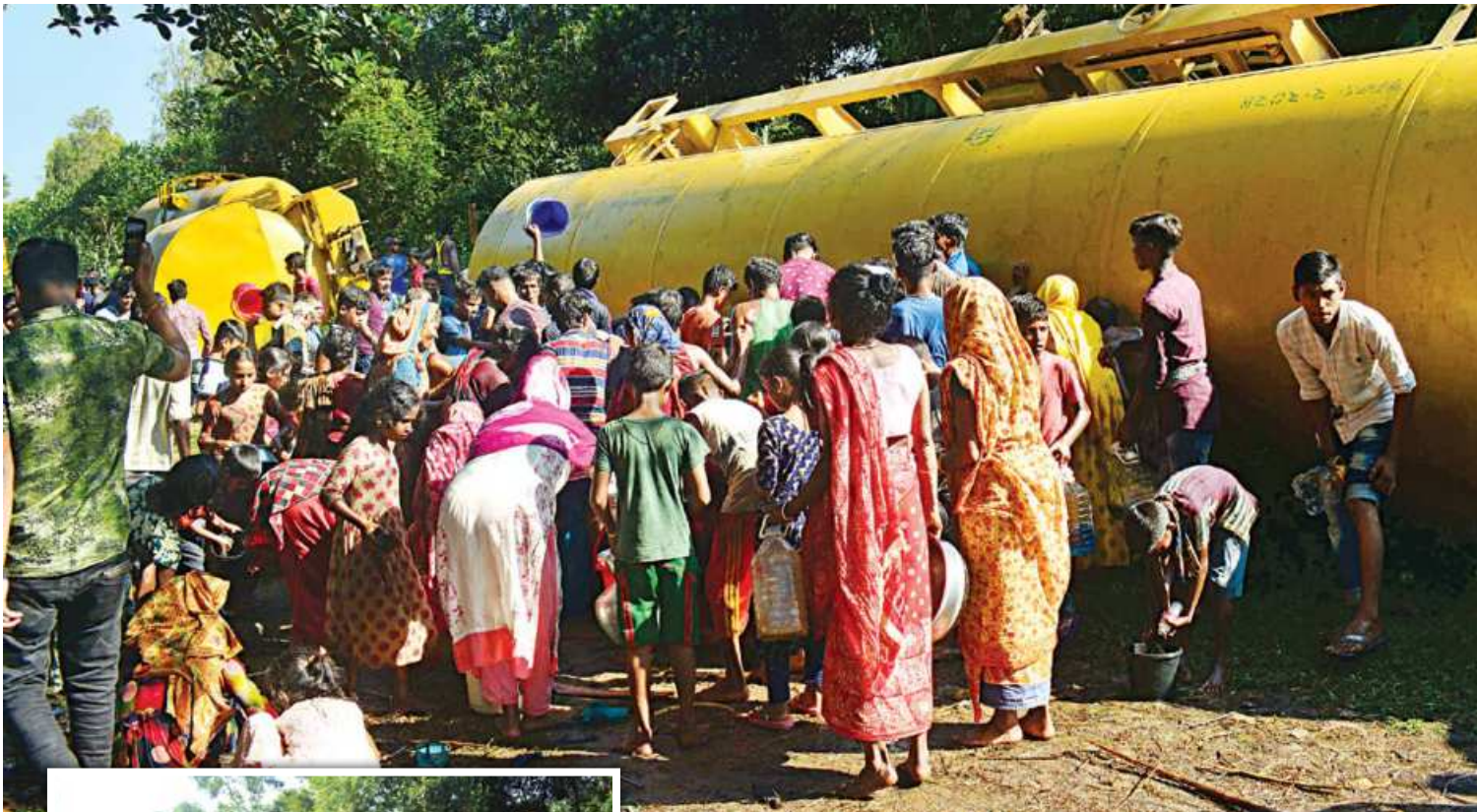
Locals gathered to collect fuel spilled from the wagons of a freight train that came off the lines near Satgaon Railway Station in Moulvibazar's Sreemangal upazila yesterday. Inset, ripped out rail lines and undercarriages after wagons of the train derailed. There was another rail accident in Gazipur in which a bus and a train collided. At least two people died in that incident.