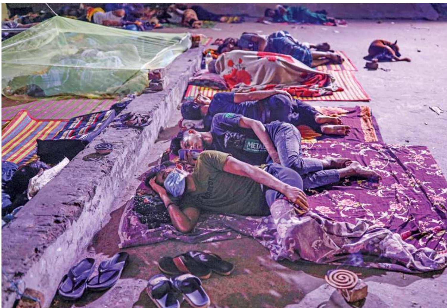
People, mostly fathers of newborns, sleeping under the open sky with their children and relatives admitted at the Agargaon Shishu Hospital in the capital. The hospital allows only one attendant with patents inside their territory. Many of these people came from other districts and have no place to stay in the capital. The photo was taken recently.