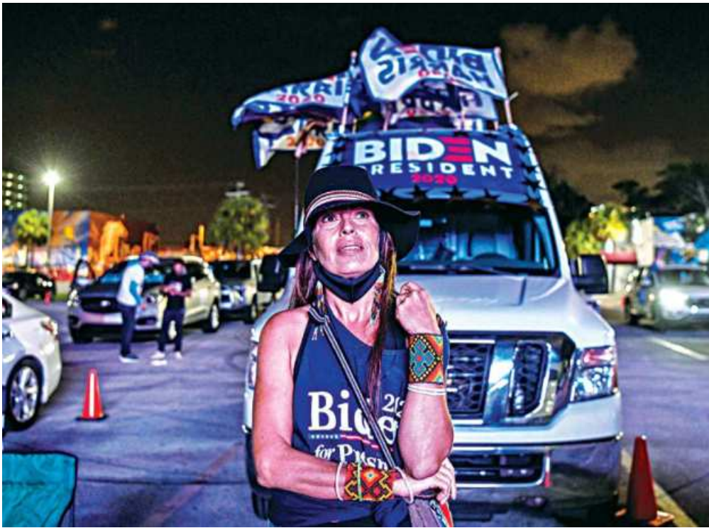
(From left) A supporter of the Democratic party react as they attend a watch party in Miami, Florida; and Republican supporters celebrate as they watch Ohio being called for Donald Trump at a Republican watch party in Michigan. Both photos were taken on US election day.