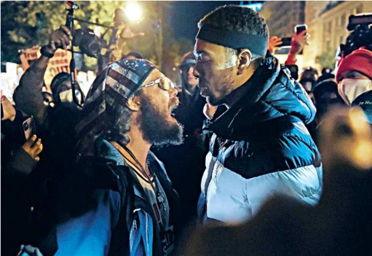
A Trump supporter (L) clashes with a demonstrator at Black Lives Matter plaza across from the White House on election day in Washington, DC. Despite fears of violence, a handful of incidents stood out on an otherwise mostly tranquil election day as Republican President Donald Trump battled for a second term against Democratic challenger Joe Biden.

Trump did win 56% of Pennsylvania voters who are at least 45 years old, which is 3 points higher than 2016.