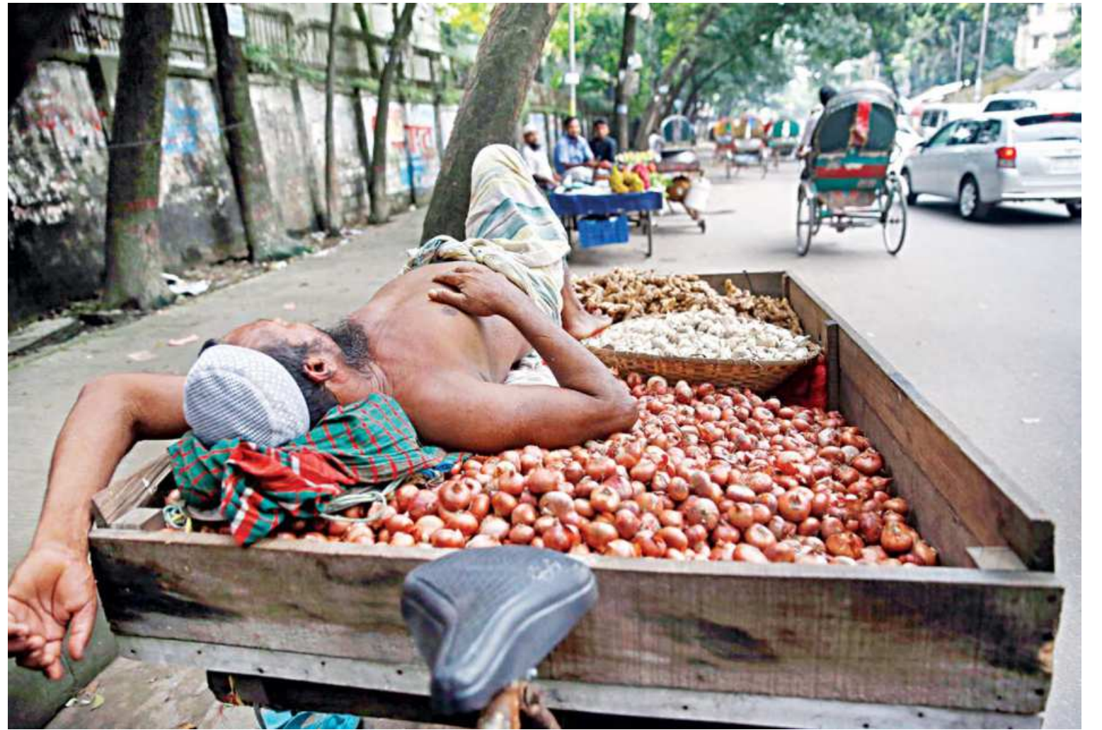
ON A BED OF ONIONS... A hawker lying on top of his cart of onions on the side of a road near the Palashi intersection in the capital yesterday afternoon. The price hike of this essential item has transformed a once-thriving business into one which draws the attention of very few pedestrians.

The then IO of the case, SI Saifullah, SEE PAGE 4 COL 2