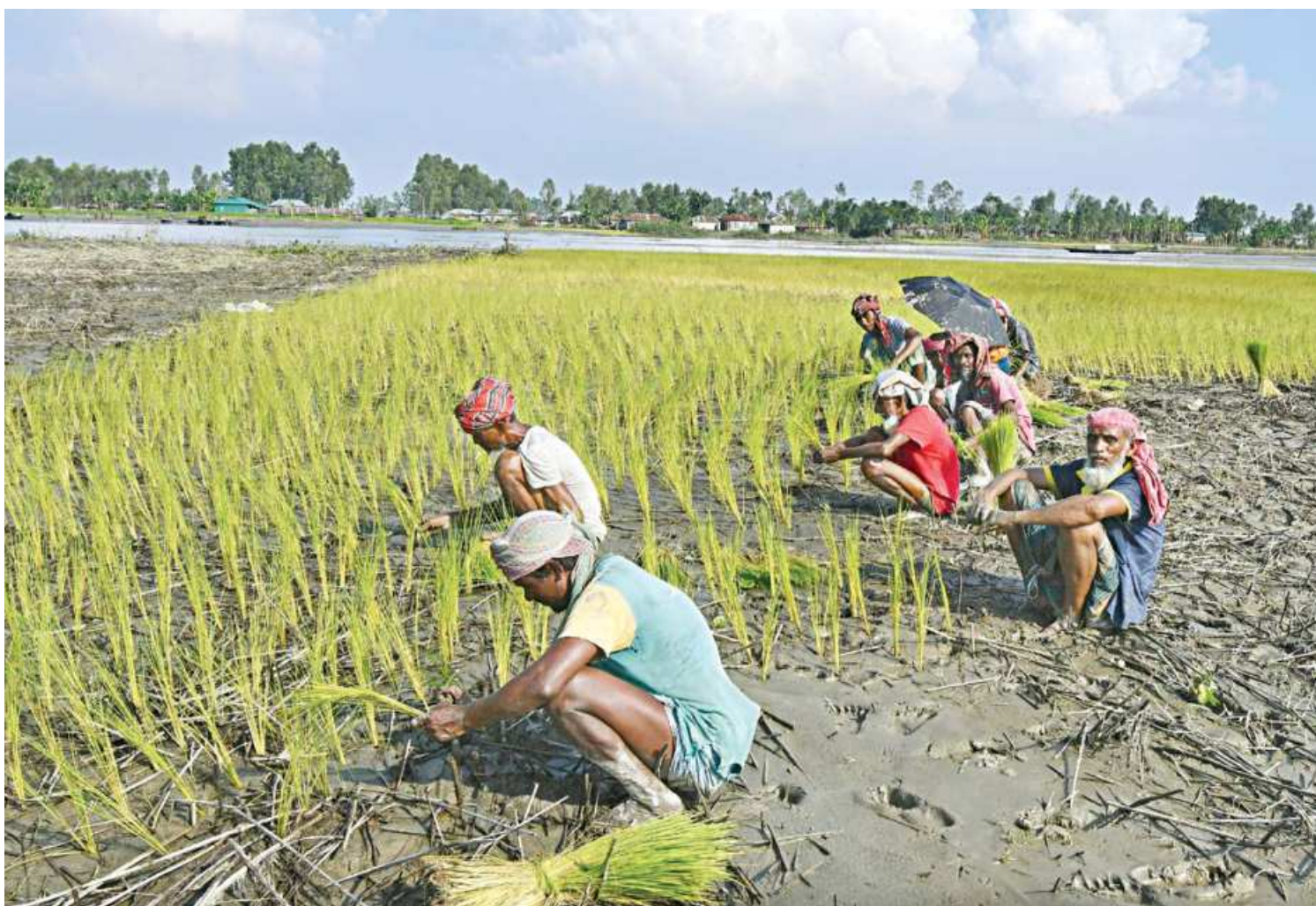
Farmers in Bogura's Sariakandi upazila planting paddy seeds of a local variety after flood water recently receded from the area. Flooding in the upazila caused widespread damage to crops, amounting to about Tk 63.92 crore, and currently 500 hectares of crops are under water.