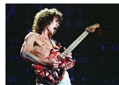
Eddie Van Halen with his iconic 'Frankenstrat'.

"I think I got the idea of tapping watching Jimmy Page do his 'Heartbreaker' solo back in 1971. He was doing a pull-off to an open string, and I thought wait a minute, open string... pull off. I can do that, but what if I use my finger as the nut and move it around? I just kind of took