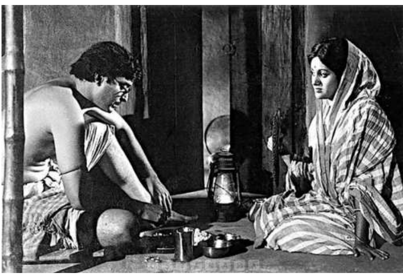
In Satyajit Ray's 'Ashani Sanket'.

"Not many live to look back on a 50-year career. I consider myself lucky for this privilege," says the star. "Throughout these beautiful years, the audience's love has been my biggest achievement."