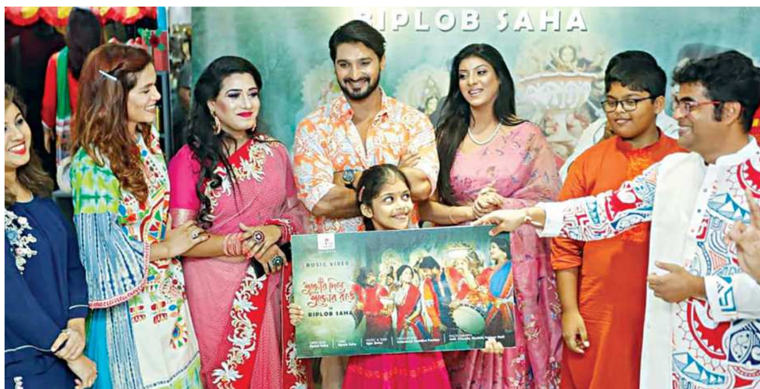
At the launching ceremony of the song, 'Pujor Dine Pujor Rong'