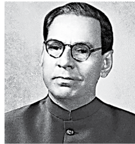
Abul Mansur Ahmad (1898-1979)

During that time, the Hindu community had an "extremely adverse" attitude towards Pakistani Prime Minister Huseyn Shaheed Suhrawardy. And Abul