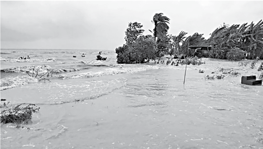
Coastal areas in Patuakhali inundated during cyclone Amphan.

The third additional factor is the global Covid-19 pandemic, which has clearly shown what the deadly consequences will be for national leaders who ignore the scientists and refuse to take timely actions. We are seeing, in real time, the enormous losses in human lives in countries where their leaders