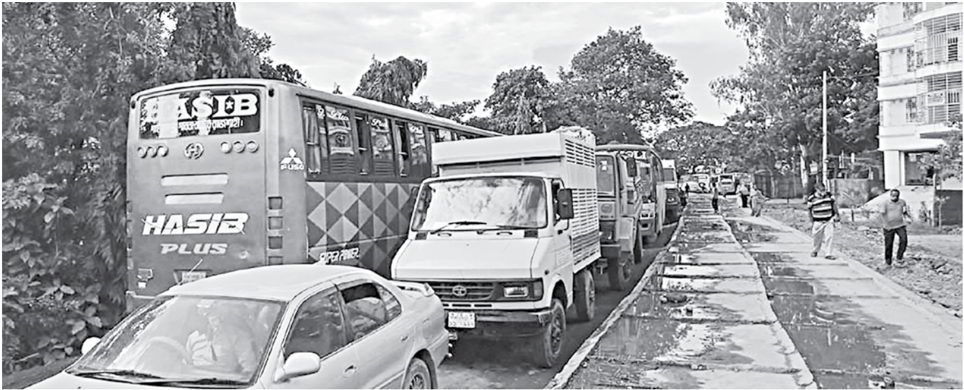
Vehicles get stuck in a long tailback on Bogura-Nagarbari highway in Sirajganj's Shahzadpur upazila as only one side of the road can be used due to the reconstruction work near BSCIC bus stand.