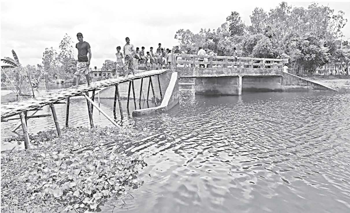
Locals build a bamboo bridge on a flood-damaged road on self-help basis at Teesta river shoal village Rudreshwar in Lalmonirhat's Kaliganj upazila. Another bamboo bridge erected by people at Milon Bazar village in the same upazila.