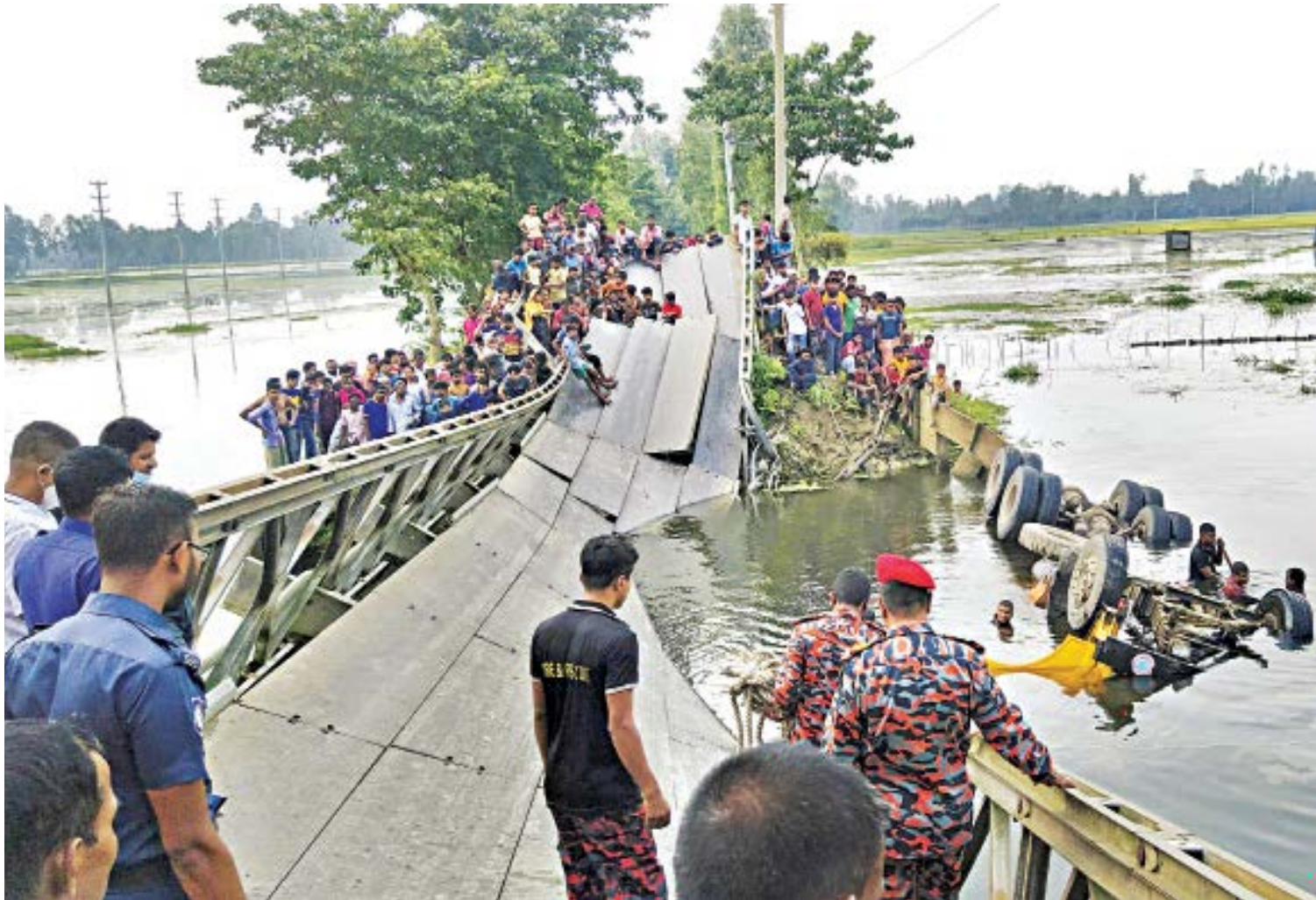
Firefighters trying to rescue a truck that fell into the water after a bridge collapsed in Gaibandha's Fulchhari upazila yesterday. Local government engineers said the bridge was in good condition but was damaged by overloaded trucks. Bailey bridges are usually rated at certain load capacity and trucks often use them with loads exceeding that.