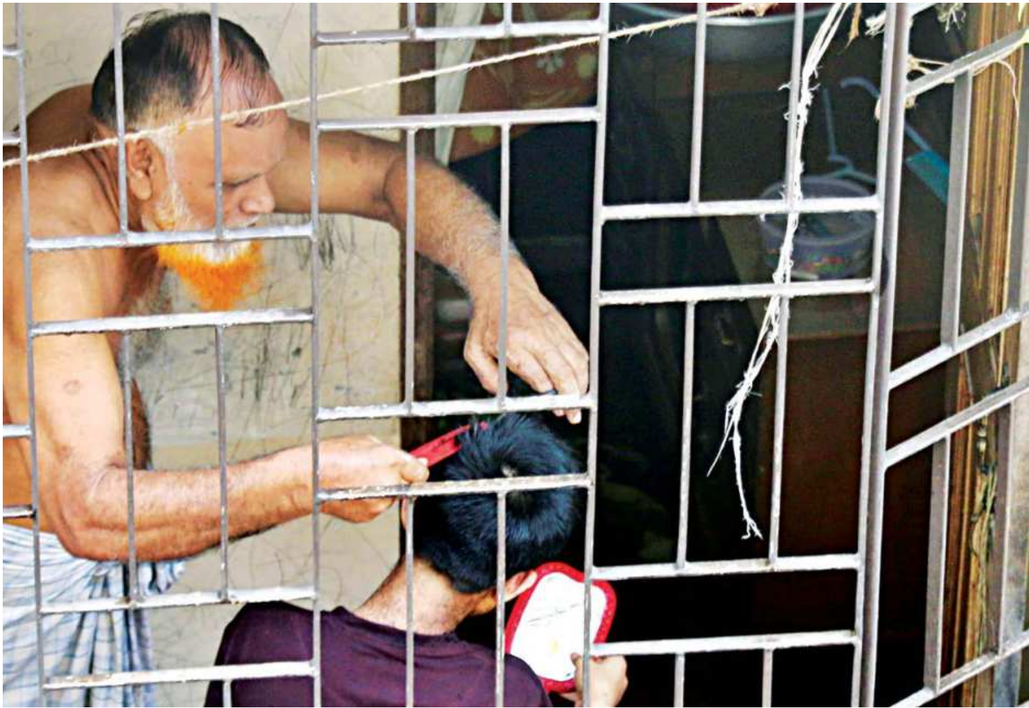
An uncle cutting the hair of his nephew at their balcony in the capital's Tejgunipara area. Many are refraining from going to hair salons fearing they can get infected by the highly contagious coronavirus. Barbers are having hard times due to lack of customers. The photo was taken yesterday.