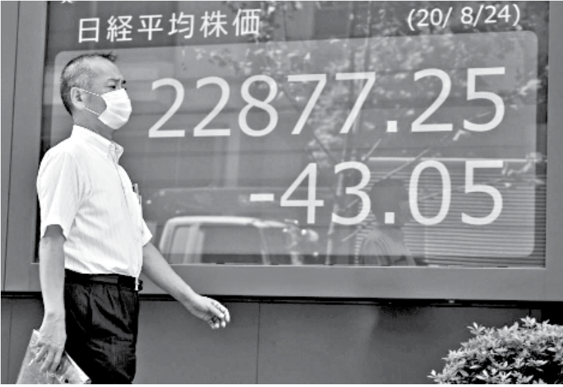
A man walks past an electronic stock board showing Japan's Nikkei 225 index at a securities firm in Tokyo Monday, Aug. 24, 2020. Asian stock markets rose Monday after Wall Street hit a new high despite lingering unease about a possible second wave of coronavirus infections.

Buying was also boosted by news that Trump had expanded the use of a coronavirus treatment using plasma from people who had recovered from