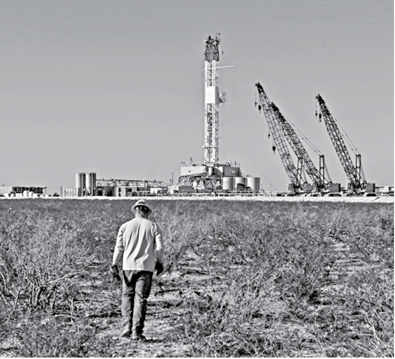
An oil worker walks towards a drill rig after placing ground-monitoring equipment in the vicinity of the underground horizontal drill in Loving County, Texas, US.

Also supporting prices was a report by the Financial Times that U.S. President Donald Trump is considering fast-tracking an