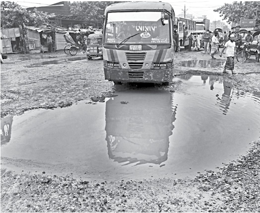
Insistent rain in the last few days has put road communication at Postogola’s Rajabari Mor under severe strain, with massive potholes turning into dangerous puddles.