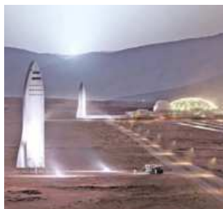
SpaceX reportedly planing a "spaceport resort" in Texas

Google introduces virtual visiting card in India