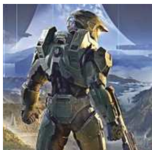
Halo Infinite delayed to 2021

Published by the Editor from Transcraft Ltd, 229, Tejgaon Industrial Area, Dhaka on behalf of Mediaworld Ltd., 52 Motijheel C.A., Dhaka-1000.