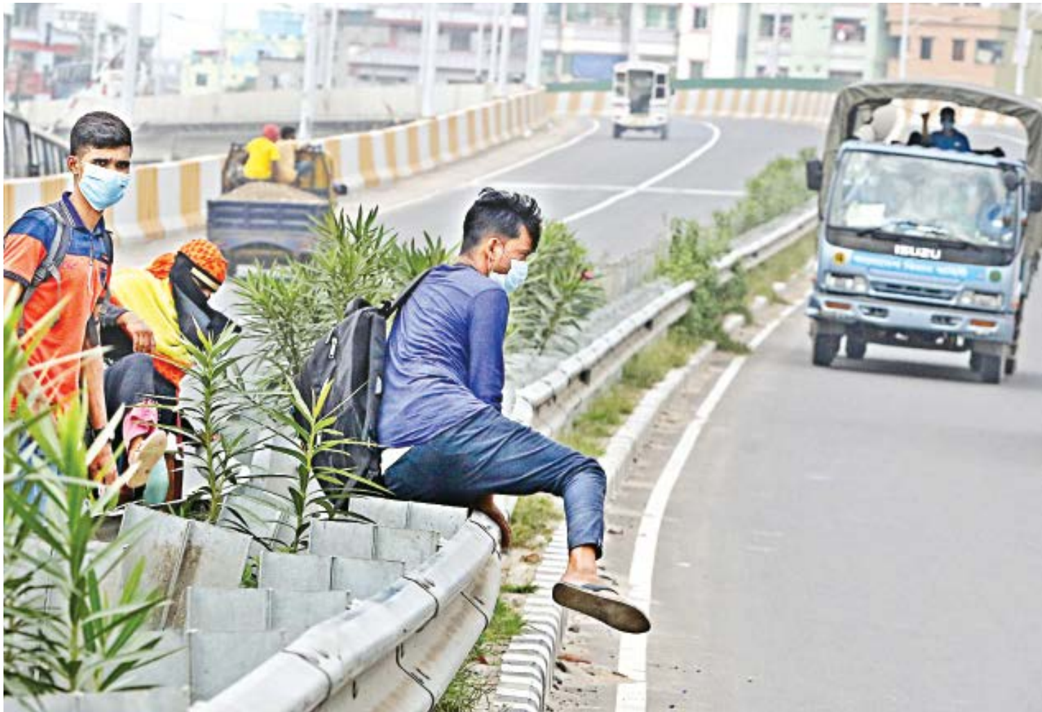
People jumping over the divider on Dhaka-Mawa expressway to get to the other side. Since the expressway is a direct route from Jurain to Mawa with no room for stoppages, many people opt to disembark right in the middle of the expressway, posing risks to their lives and the lives of others. The photo was taken yesterday.