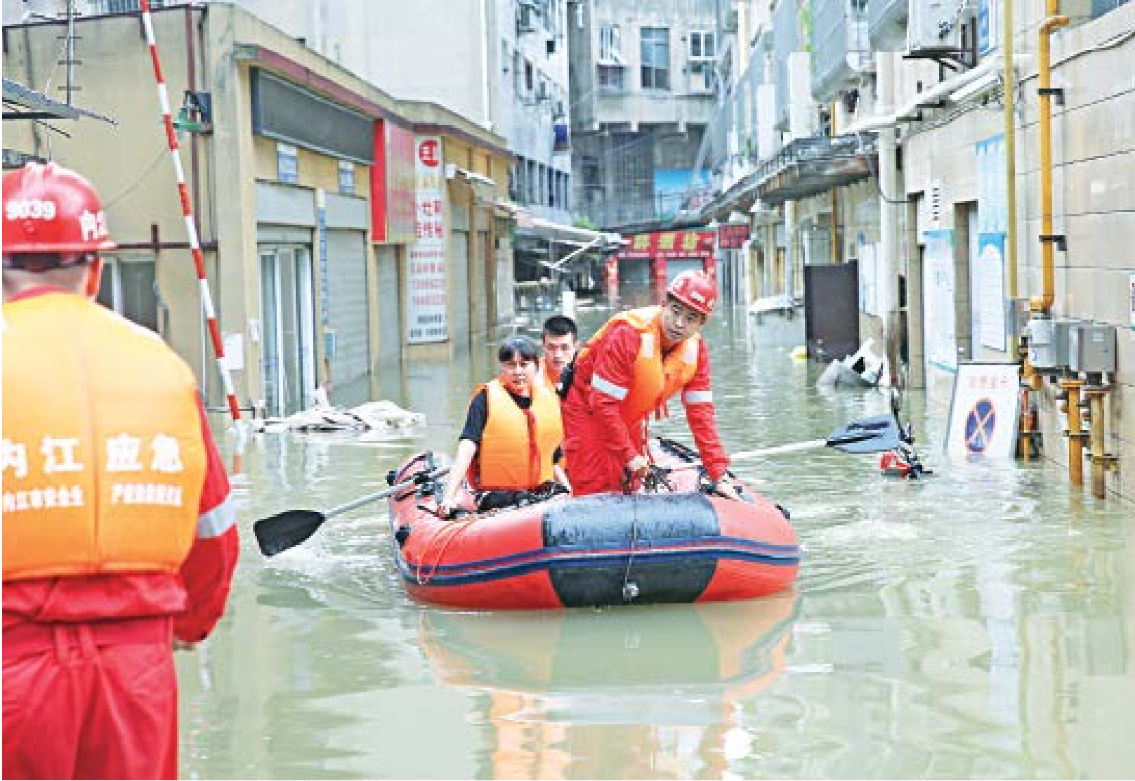
Rescue workers evacuate a resident stranded by floodwaters following heavy rainfall in Neijiang of Sichuan province, China yesterday.

South Korea and the United States began annual military exercises yesterday following a coronavirus delay, with the drills likely to infuriate the North which has long considered them rehearsals for invasion.