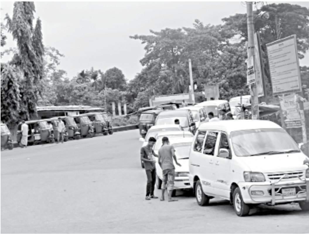
This road at Sylhet city’s Temukhi Tokerbazar area has transformed into an illegal stand for auto-rickshaws and microbuses. Locals say there are dozens of such illegal stands in the city that constrict roads, and there are often patronised by political leaders.