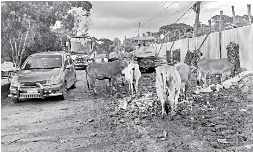
The garbage from nearby Moilakanda landfill has spilled over to the Mymensingh-Sherpur road, where animals were spotted gathering to scavenge for food. The photo was taken recently.

It is difficult to erect walls around it by digging out 20-40 feet layer of garbage, he claimed.